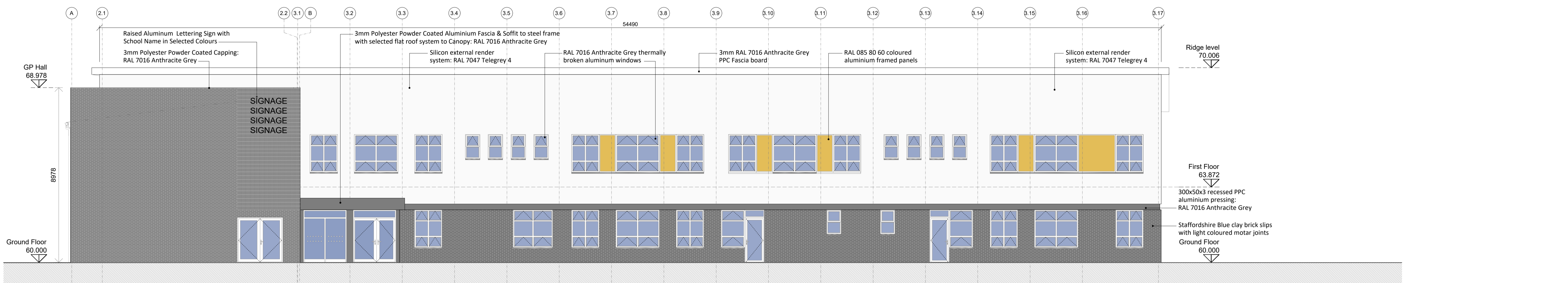
2 PROPOSED SOUTH ELEVATION 1:100 @ A1