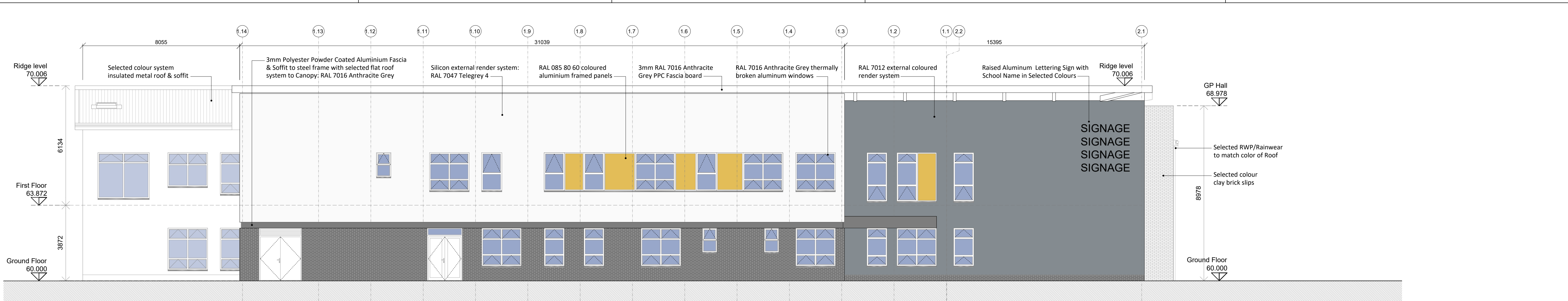
1 PROPOSED NORTH ELEVATION 1:100 @ A1