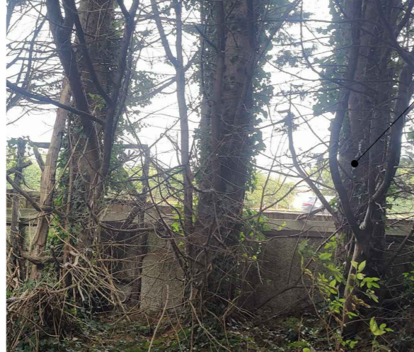
Group 02 - to be removed