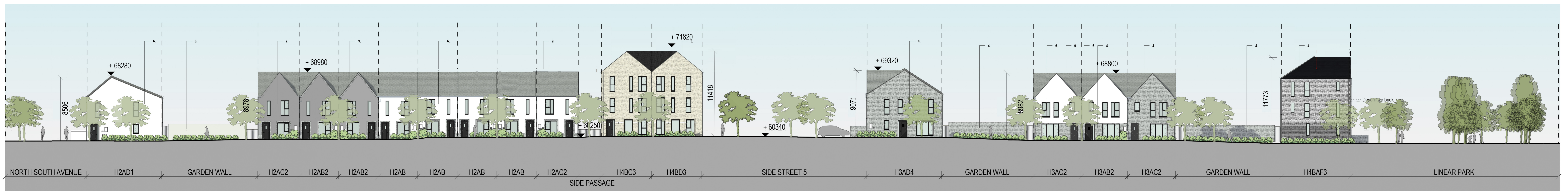
1 ZONE 2 CONTEXTUAL ELEVATION - SIDE STREET 7 01 Scale: 1:200