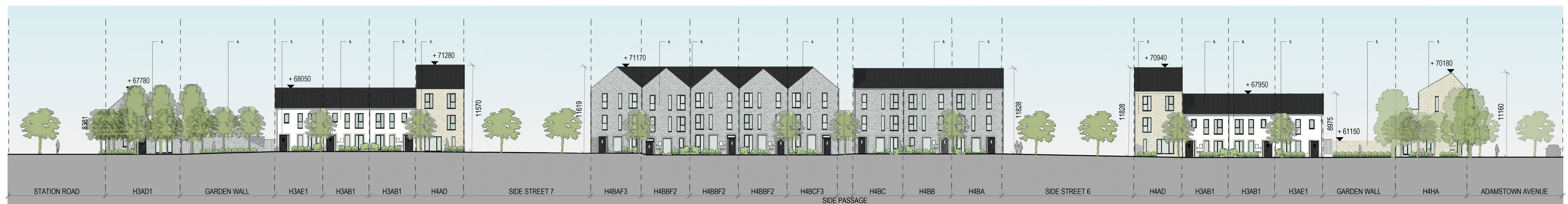
3 ZONE 2 CONTEXTUAL ELEVATION - LINEAR PARK Scale: 1:200