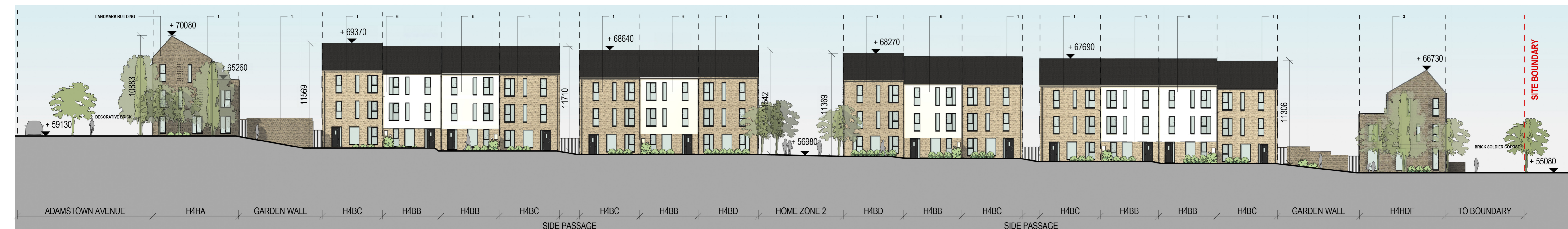
③ ZONE 1 CONTEXTUAL ELEVATION - LINEAR PARK Scale: 1 : 200