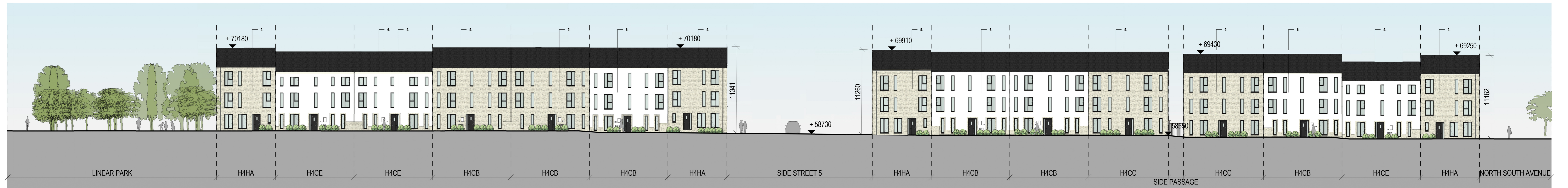
1 ZONE 2 CONTEXTUAL ELEVATION - ADAMSTOWN AVENUE Scale: 1:200