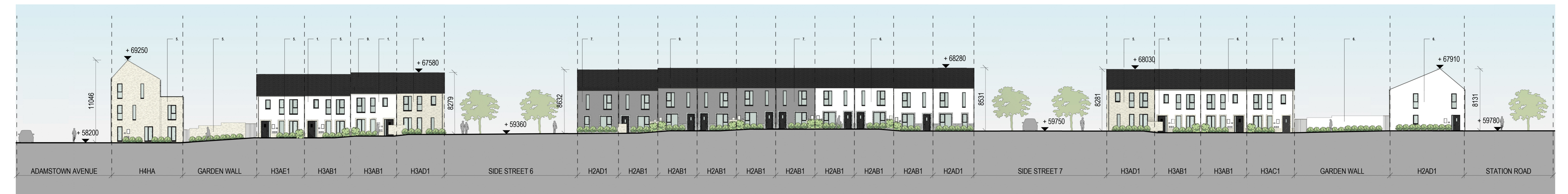
4 ZONE 2 CONTEXTUAL ELEVATION - NORTH-SOUTH AVENUE 02 Scale: 1:200