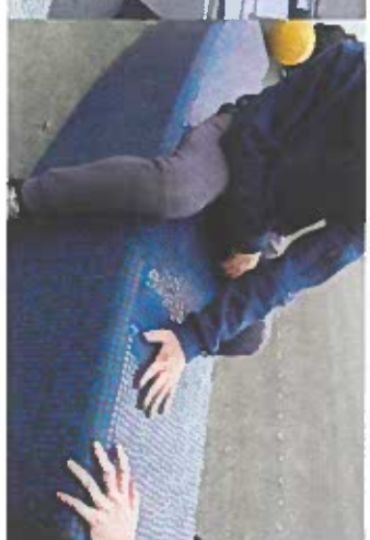
St Finian's, Newcastle, Co Dublin