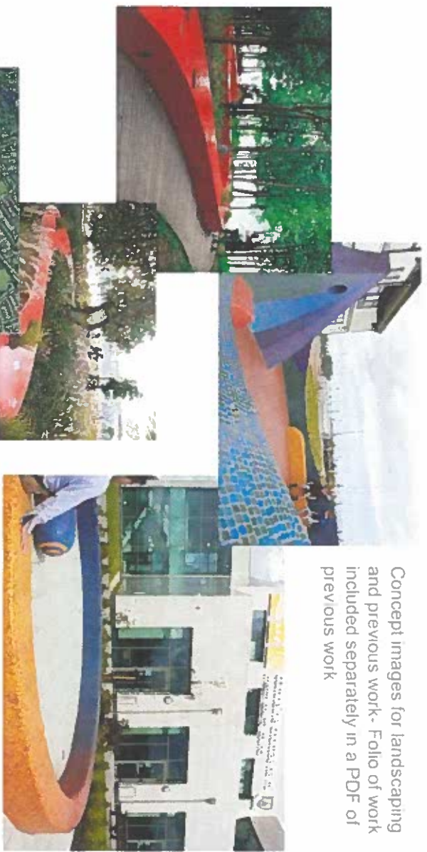
Concept images for landscaping and previous work - Folio of work included separately in a PDF of previous work