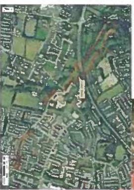
South Dublin County Council Geological report: Eskers in Lucan and surrounding area.