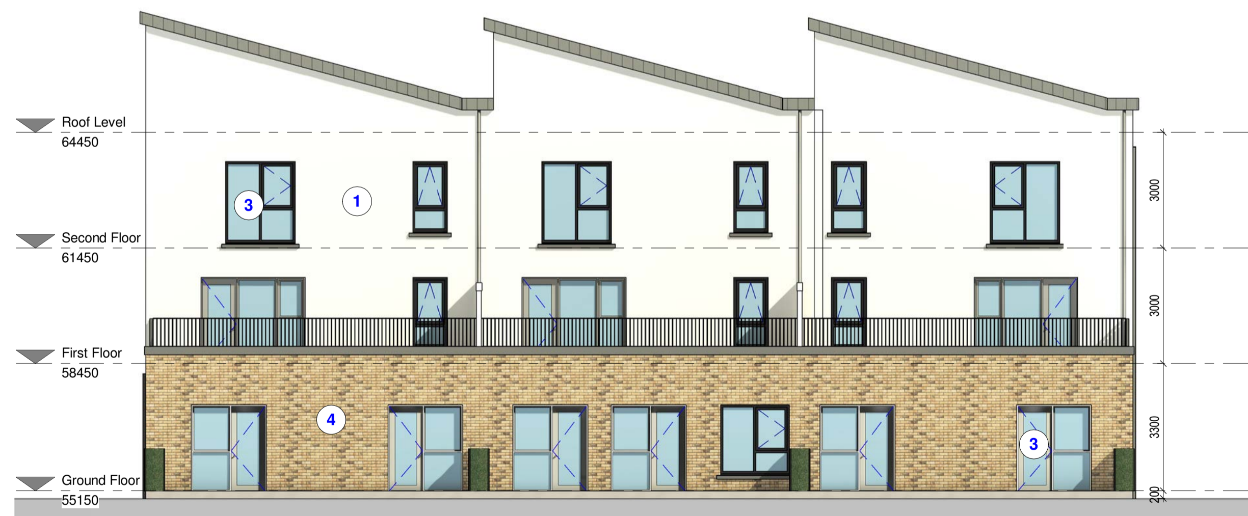
BLOCK 1 REAR ELEVATION 1 : 100