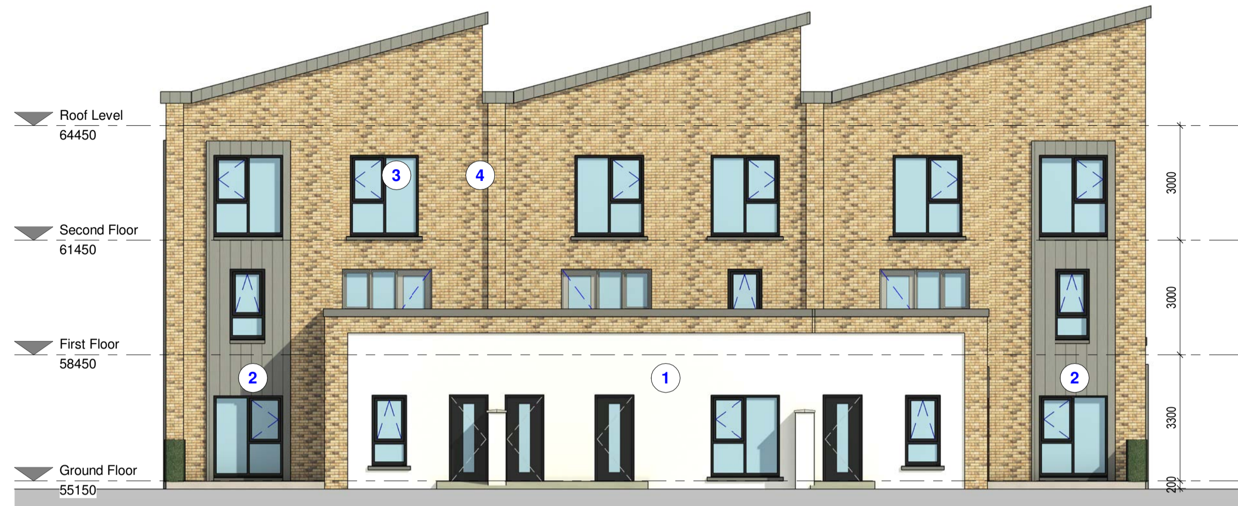
BLOCK 1 FRONT ELEVATION 1 : 100