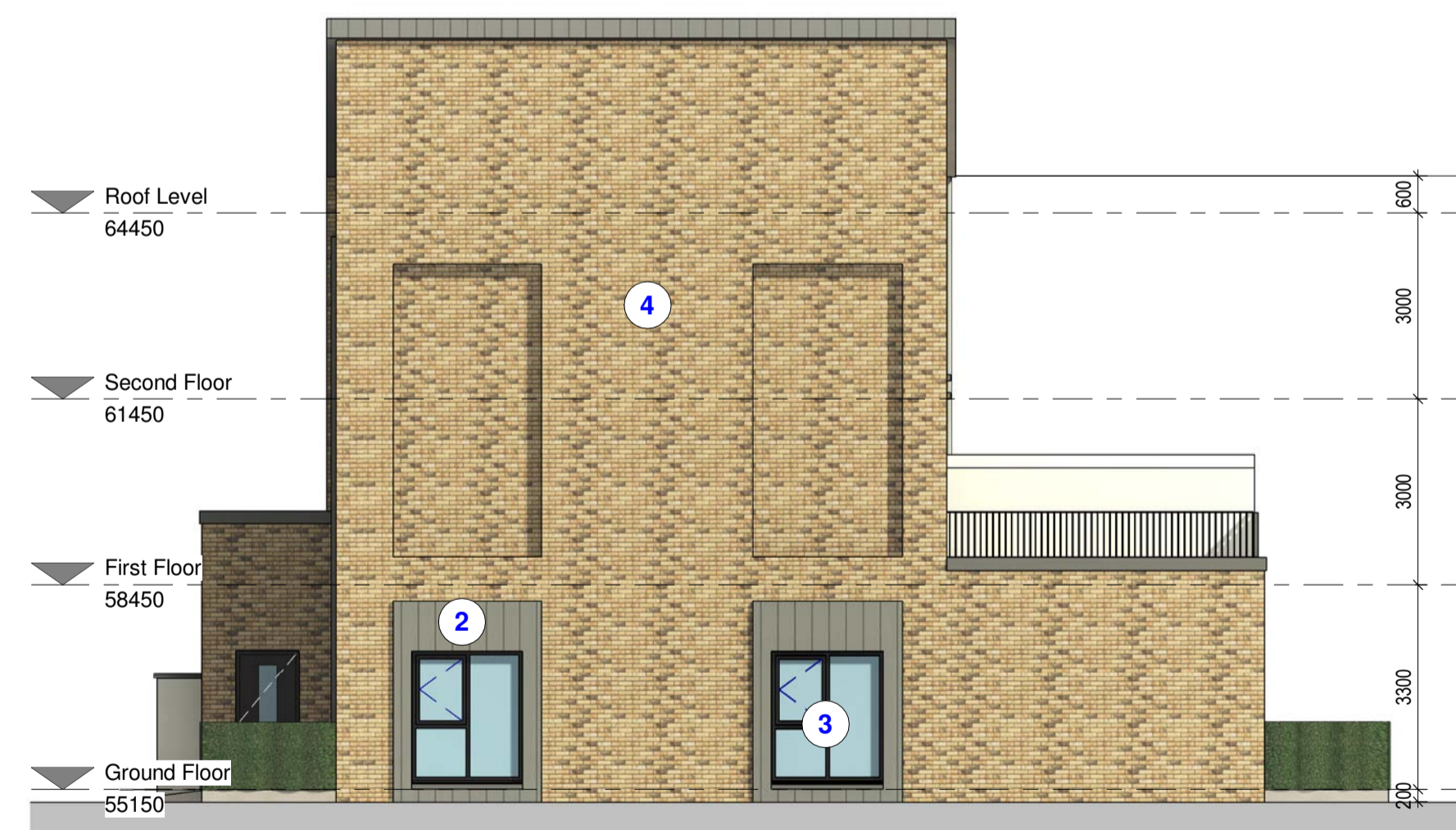
BLOCK 1 SIDE ELEVATION (EAST) 1 : 100

NOTES: Compliance with Planning Condition 2(c). Ref ABP-314272-22. All brick recesses and window reveals are minimum 1 brick length deep, set back 225mm from the wall face.