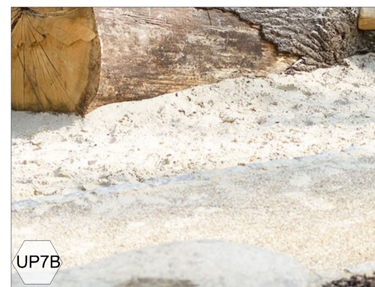
UP7B Sand Pit Surfacing Depth - 150mm, Well compacted