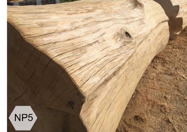
NP5; Overturned Tree Logs - Seating Sanded where appropriate Note: Locally sourced from tree felling within the Clonburris SDZ