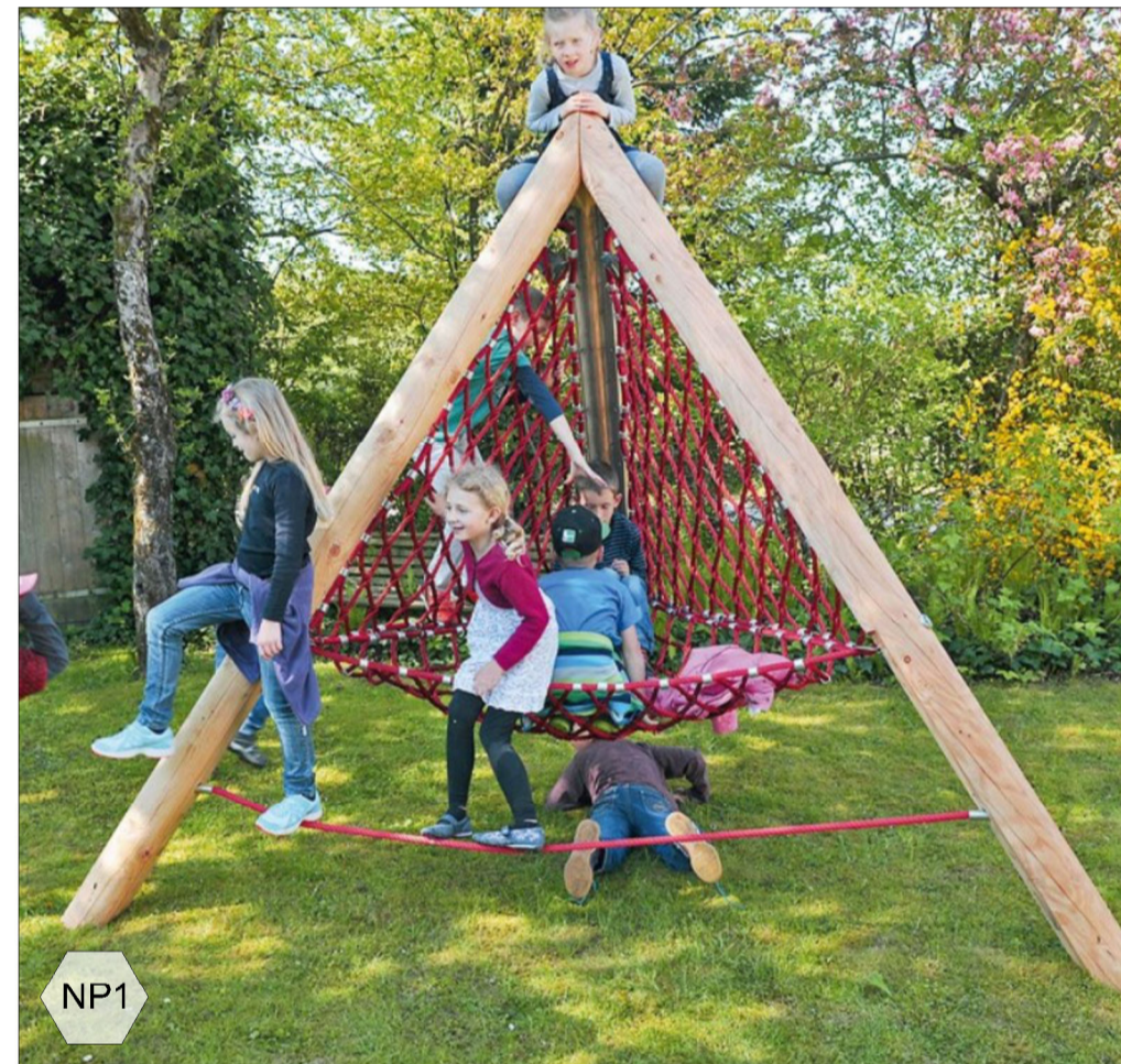
NP1; Rope Pyramid by Timberplay, set within sand surface