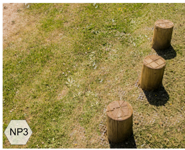
NP3; Hardwood Timber stepping logs 0.2 - 5m high, Set in in-situ concrete. By creative Play or similar approved.