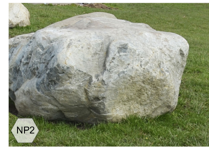
NP2; Locally Sourced Glacial boulders - various sizes upto 300 - 600mm high Installation; 300mm below ground, Form; Rounded edges