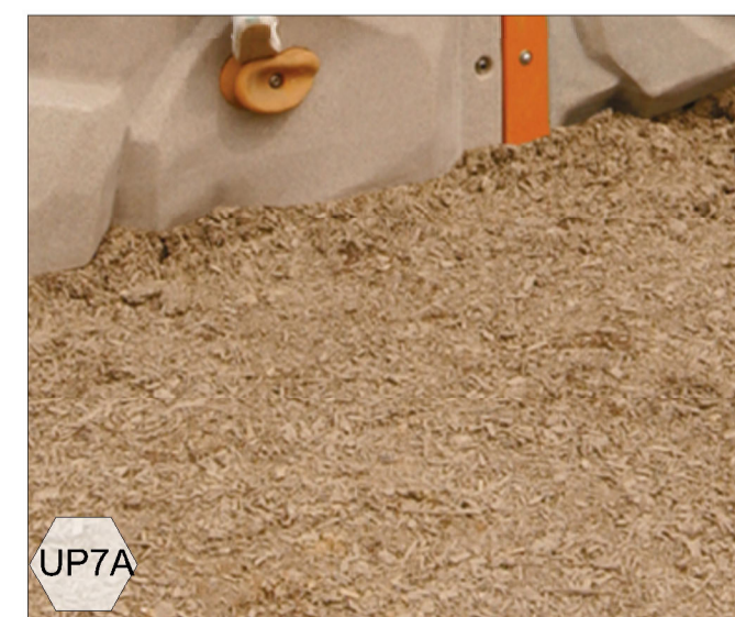
UP7A - Engineered Woodchip Surfacing