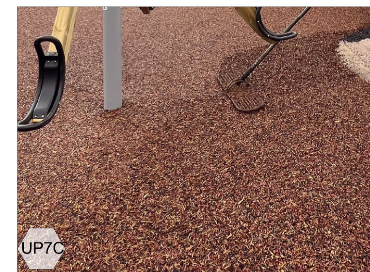
UP7C - Tiger Mulch Surfacing Colour: Natural