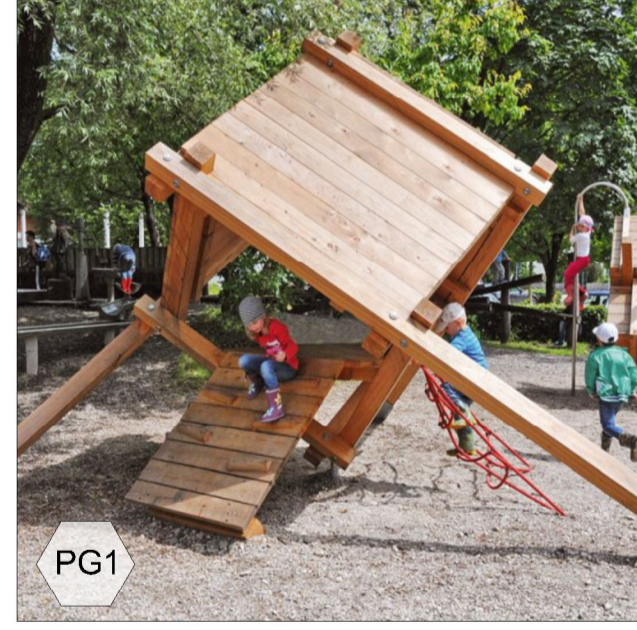
PG1; Play Cube with Sliding Pole, Inclined Wall and Inclined Climbing Net Product Code: 4.09200 By Timberplay