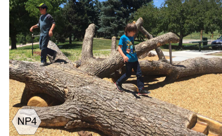
NP4; Overturned felled Tree - Climbing Form: Clipped and sanded where appropriate Note: Locally sourced from tree felling within the Clonburris SDZ