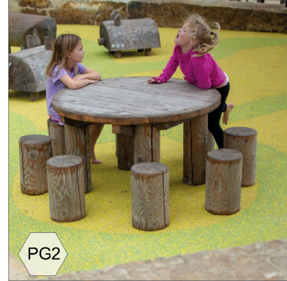
PG2 - Toddlers Table with 8 Stools By Timberplay - Product Code: 4.35050