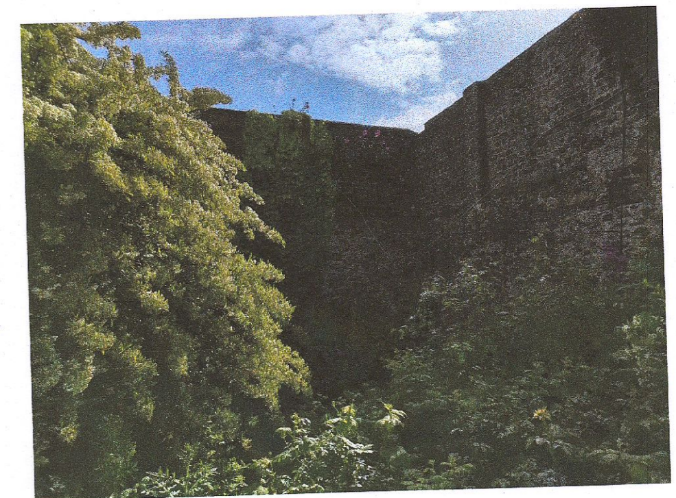
EXISTING BOUNDARY WALL VIEW-C

NOT SCALE FROM THIS DRAWING. WORK ONLY FROM FIGURED DIMENSIONS. ERRORS AND OMISSIONS ARE TO BE REPORTED TO LANDSCAPE ARCHITECT