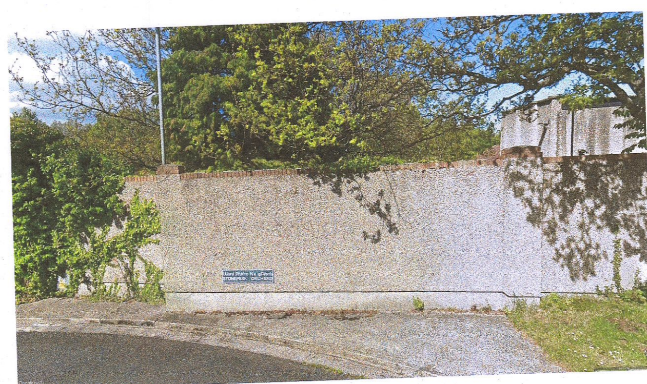
EXISTING BOUNDARY WALL VIEW-B