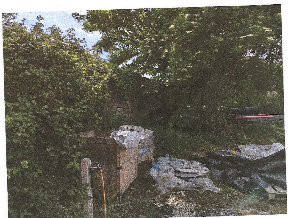
EXISTING BOUNDARY WALL VIEW-A