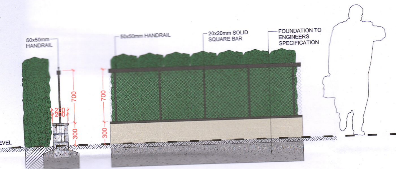
1M STUB WALL AND RAILING WITH 1.2M HEDGE SCALE - 1:30@A1