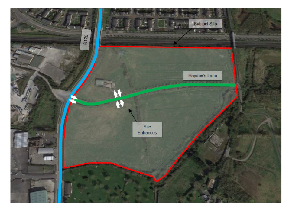
Figure 6.3 Proposed Site Entrance

The proposed construction vehicle routes will need agreed upon with SDCC and TII prior to site workings beginning.