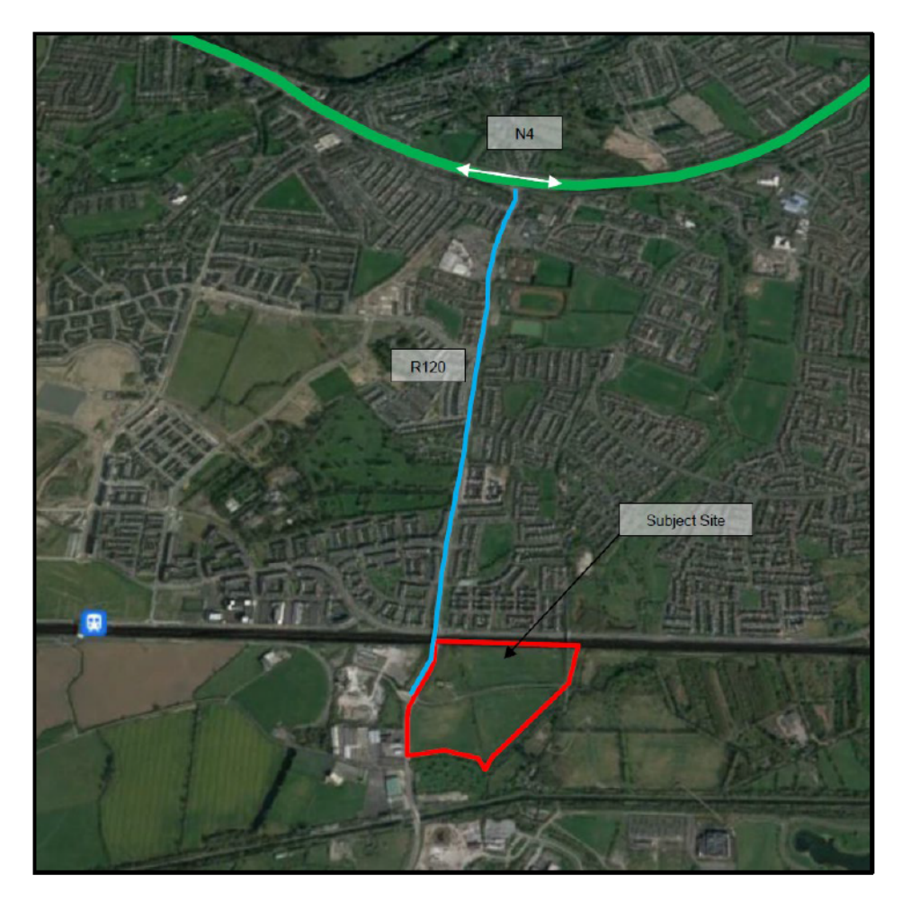
Figure 6.1 Proposed Construction Traffic Route from the Subject Site to the N4

The proposed main construction access route to the proposed development is from the N4 via the R120. The R120 forms the western boundary of the site and is a regional road from Lucan to Rathcoole. Exiting the N4 at junction 4 and travelling for 2.1km along the R120 (c. 5 minutes) then turning left onto Hayden's Lane is the point of access to the site. The N4 is the main route from Dublin to Sligo. The M50 is accessible from the N4, junction 4 by travelling eastbound for 4.7 km (c. 5 minutes) to junction 7. The route is shown in Figure 6.1 below.