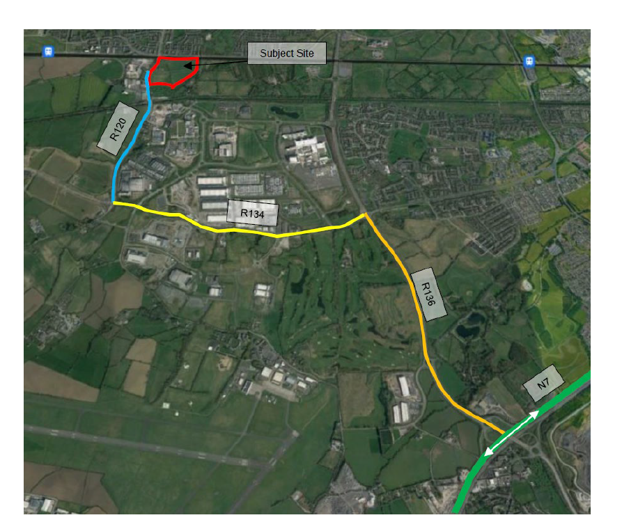
Figure 6.2 Proposed Construction Traffic Route from Subject Site to N7

Construction access to the subject site is shown in Figure 6.3 below, there will be two entrances to the site from Hayden's Lane, one entrance to access the southern site and one entrance to access the northern site.