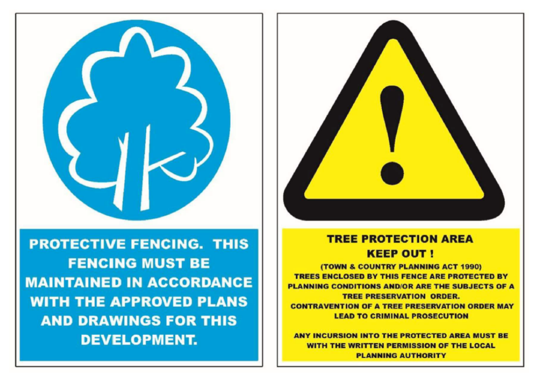
Figure 5.8 Signage to be erected on RPZ fencing

Notice boards, wires and such like will not be attached to any trees. Site offices, materials storage and contractor parking will all be outside the CEZ.