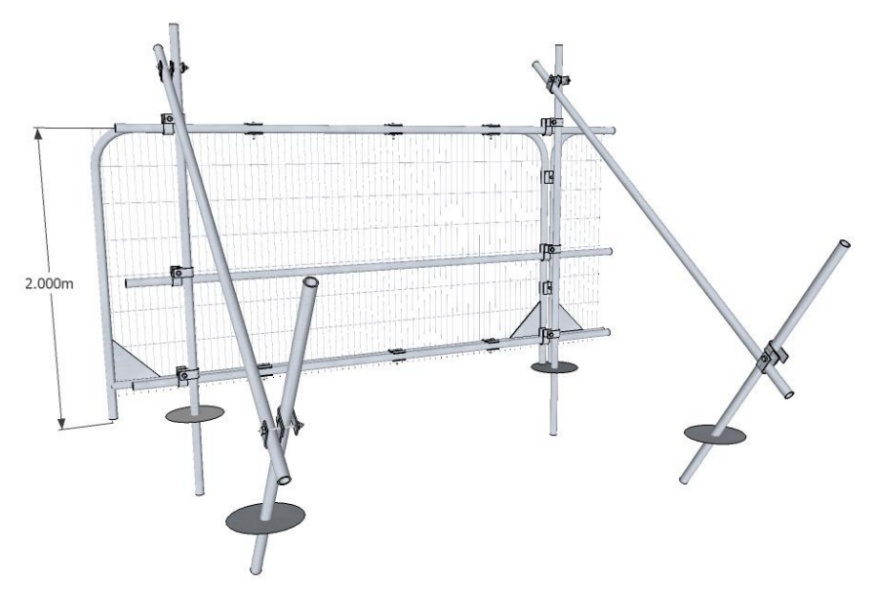
Figure 1. Protective fence specification

Tree and hedgerow protection and signage as shown in the images below will be put in place to protect the trees and hedgerows outlined in the arborist report.