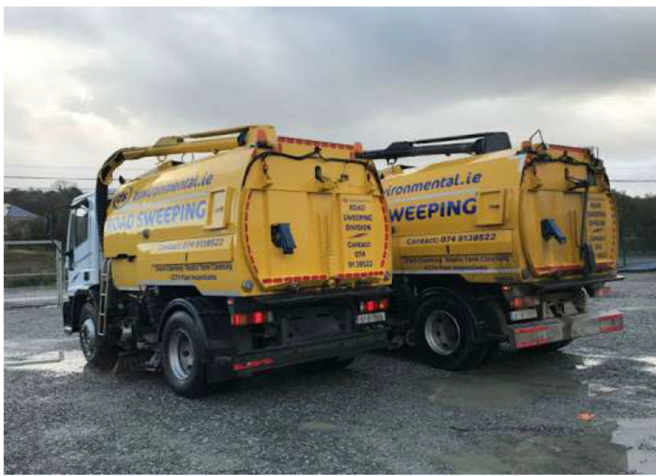
Fig 5.3 Example Vacuum Road Sweepers

In accordance with condition 16 (d) Vacuum Road sweepers will be employed to carry out vacuum road sweeping operations to remove any project related dirt and material deposited on the road network by construction / delivery vehicles. Road Sweepers will dispose of material following sweeping of road network, to licensed waste facility.