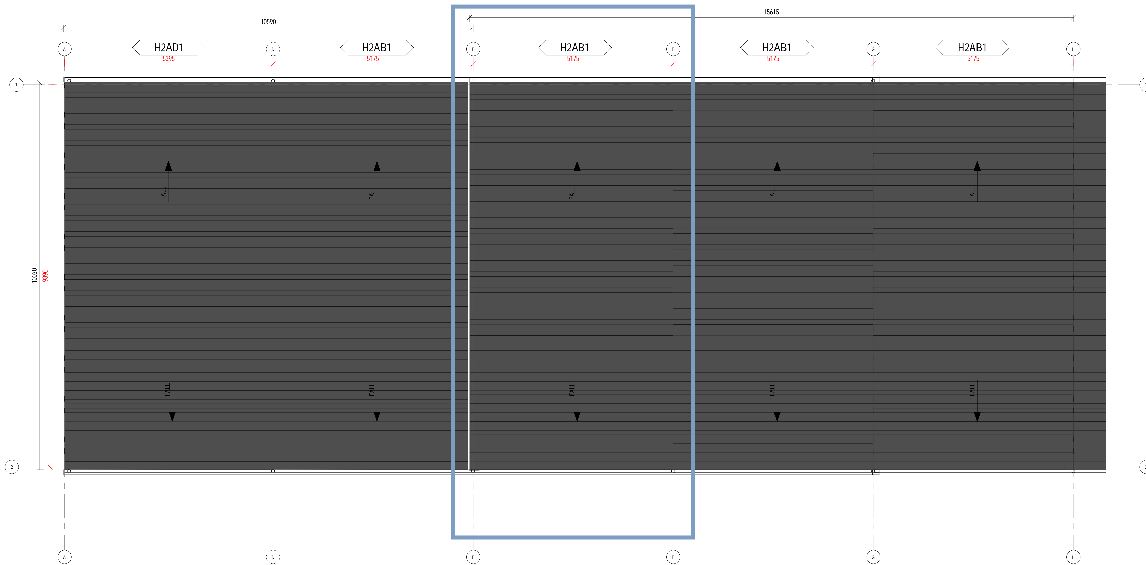
1 ROOF PLAN (1) Scale: 1 : 50