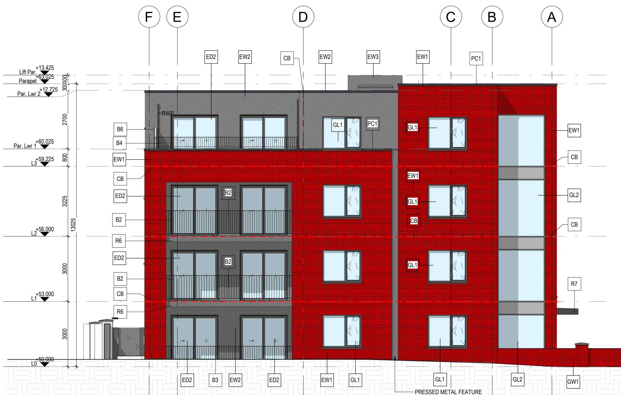
3 Side Elevation 1:100