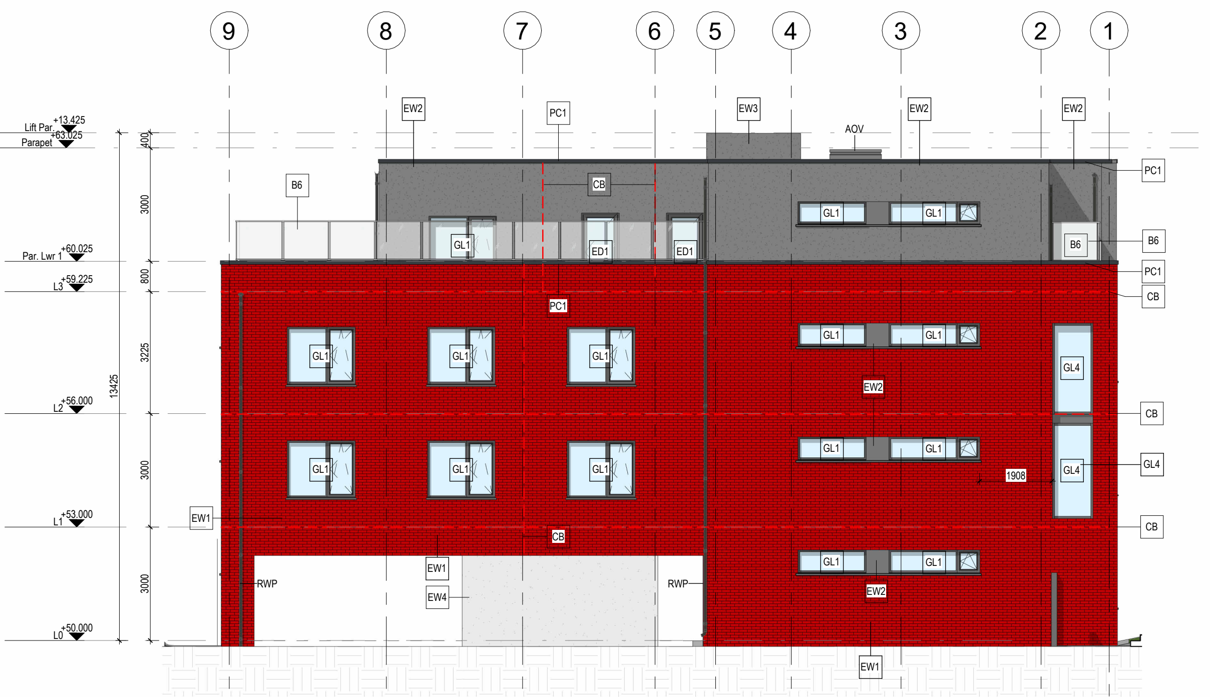
2 Rear (South) Elevation 1:100