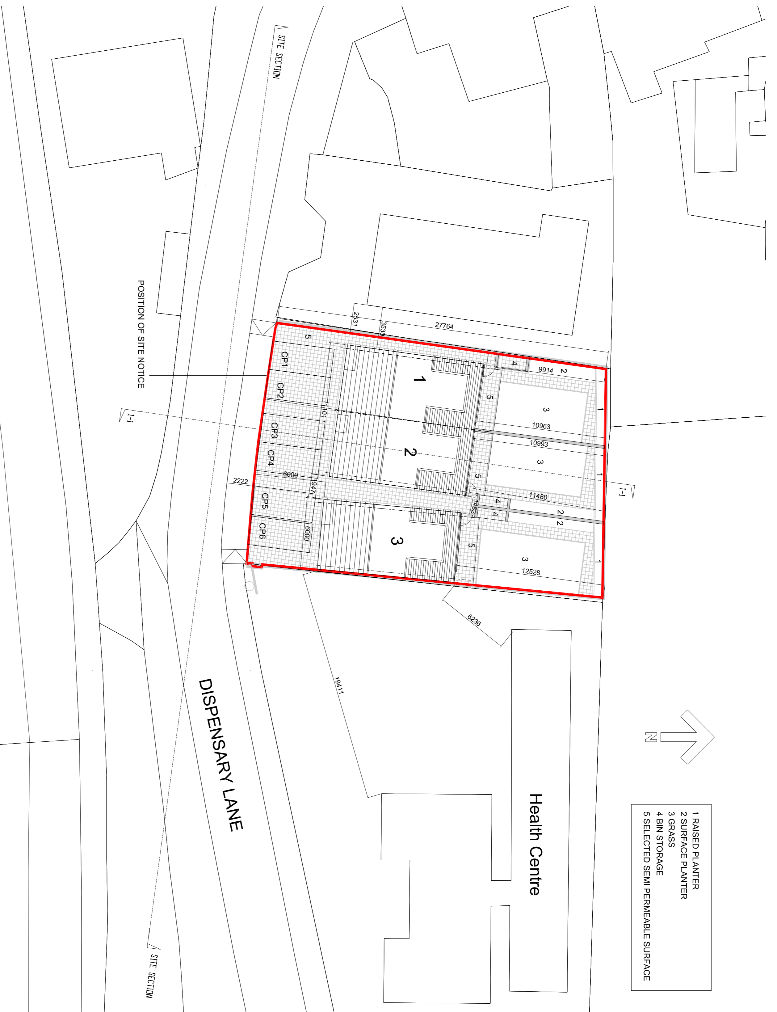
SITE PLAN - ROOF PLAN - HOUSES 1, 2, & 3 HILLVIEW, DISPENSARY LANE SCALE 1:200

PLLOT RATIO - SITE COVERAGE PLLOT RATIO - GROSS FLOOR AREA (131.5 X 3 = 394.5 SQM)/ SITE AREA 569.3 SQM PLLOT RATIO - 0.692 SITE COVERAGE - GROUND COVERAGE 190.9 SQM / SITE AREA 569.3 SQM SITE COVERAGE = 33.53%