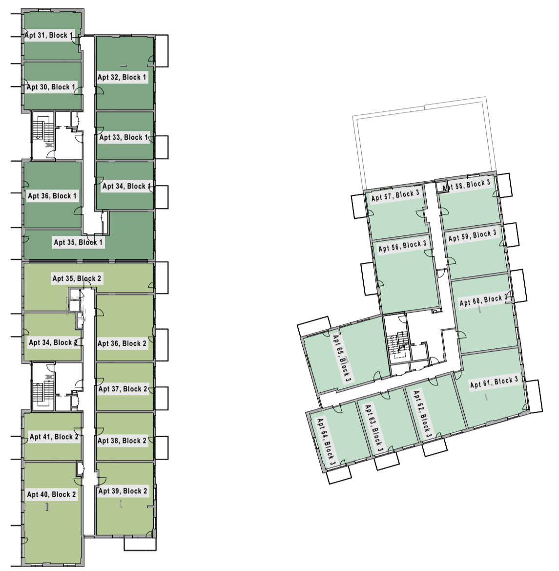
Level 05 Scale:1:500