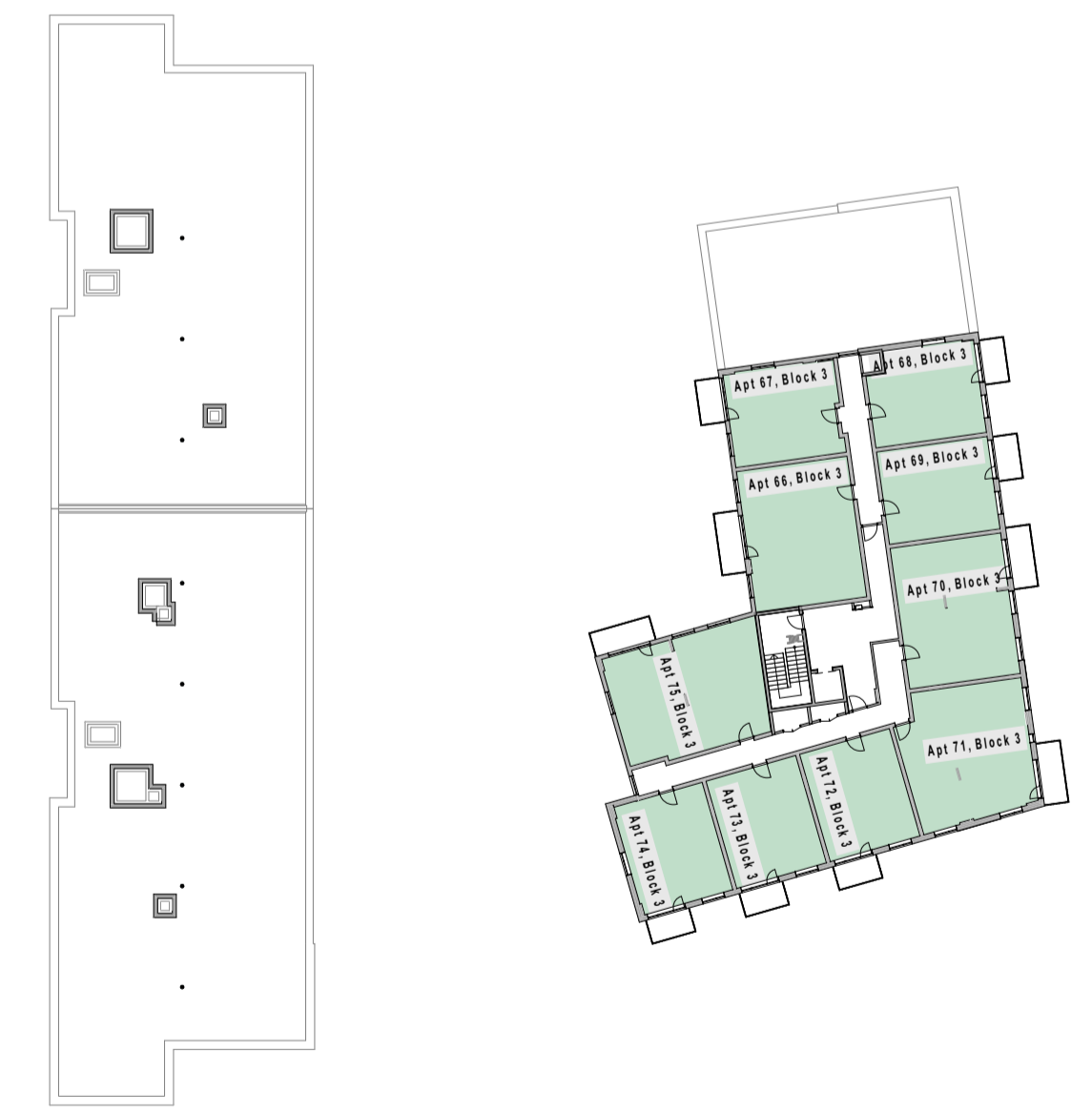
Level 06 Scale:1:500