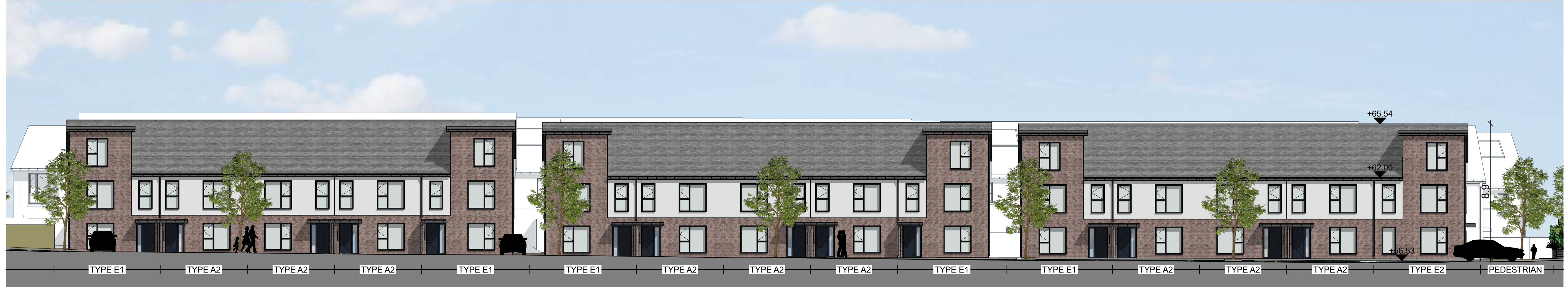
D Section SCALE 1:150