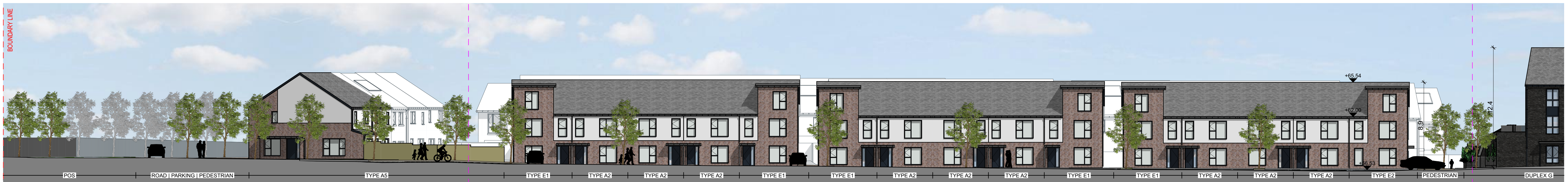
D Section SCALE 1:200