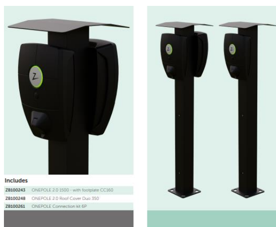
Figure 1 - Zaptec EV charger

The overall dimensions of a single charging station are 1497 H x 350 x 350 mm. The station is manufactured from Aluminium and powder coated in RAL9005 (Standard). Example below.