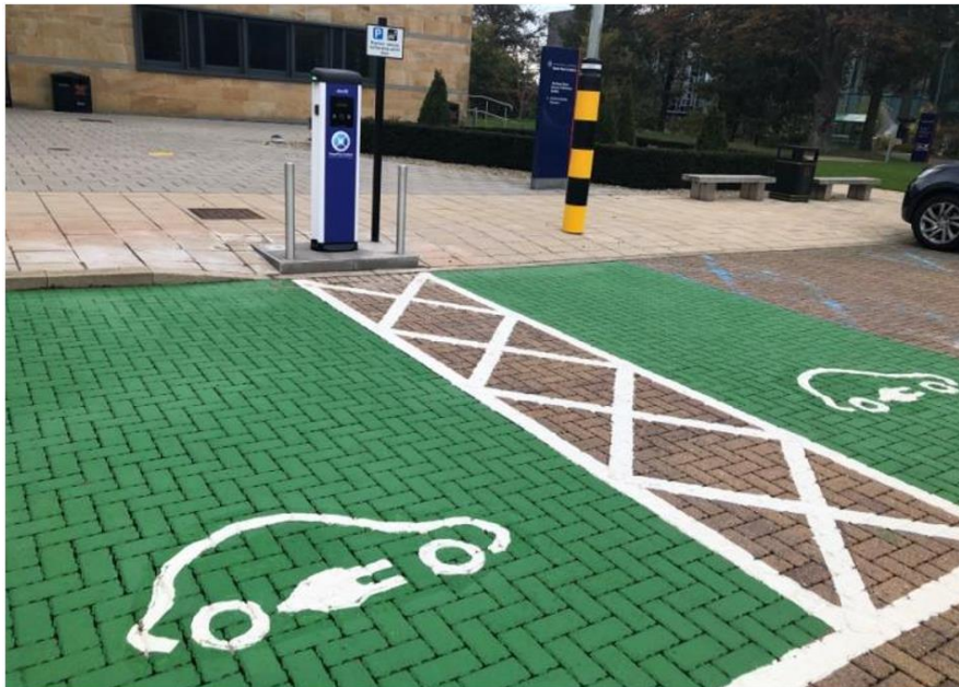
Figure 3 - Proposed EV car charging space road markings

The proposed electric vehicle parking spaces will be clearly visible with road markings and signage to identify the spaces.