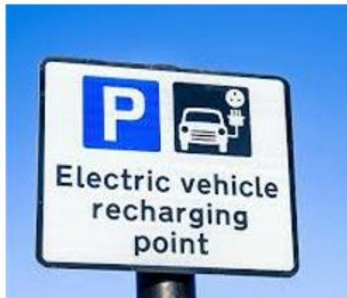
Figure 4 - Proposed EV car charging signage