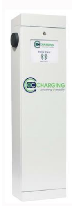
Figure 2 - EC Charging EV charger

The details of proposed EC Charging stations are set out below: