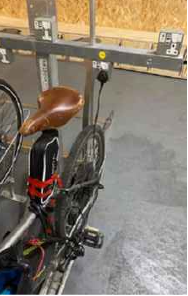
Bicycle charging facilities for E-Bikes