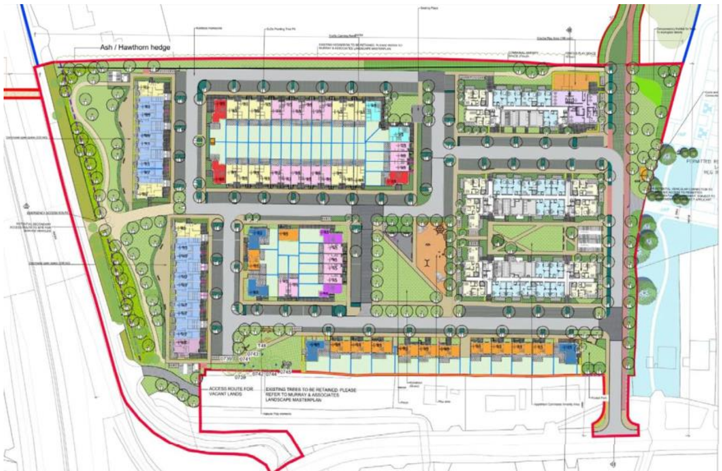
Figure 1 – The proposed site layout

This Waste Management Plan (WMP) has been prepared by Cairn to support the development of Mill Road located in Saggart, Dublin. The Proposed Development comprises of 274 no. residential units. These include 51 no. houses, comprising 17 no. 2-bedroom, 27 no. 3 bedroom, and 7 no. 4-bedroom units, 38 no. duplex units, comprising 2 no. 1 bedroom, 17 no. two-bedroom, and 19 no. 3 bedroom units, as well as 185 no. apartments, comprising 62 no. one-bedroom, 119 no. 2 bedroom, and 4 no. 3 bedroom units. The proposed buildings will range in height, from two to five storeys, with some parts of the apartment blocks rising to eight storeys.