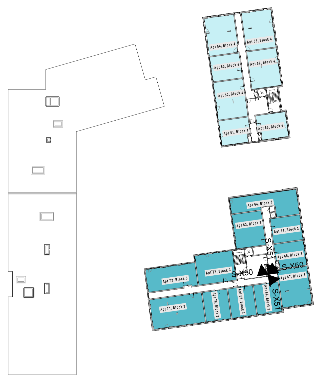
LEVEL 06 Scale:1:500