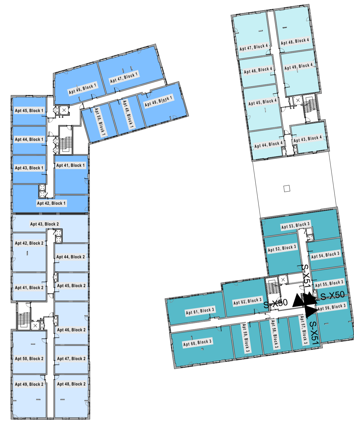
LEVEL 05 Scale:1:500