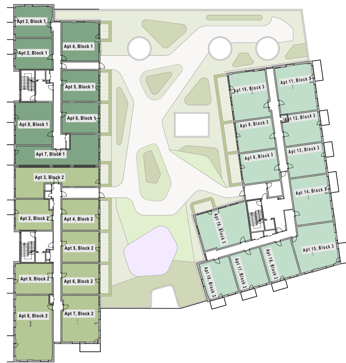
Level 01 Scale:1:500