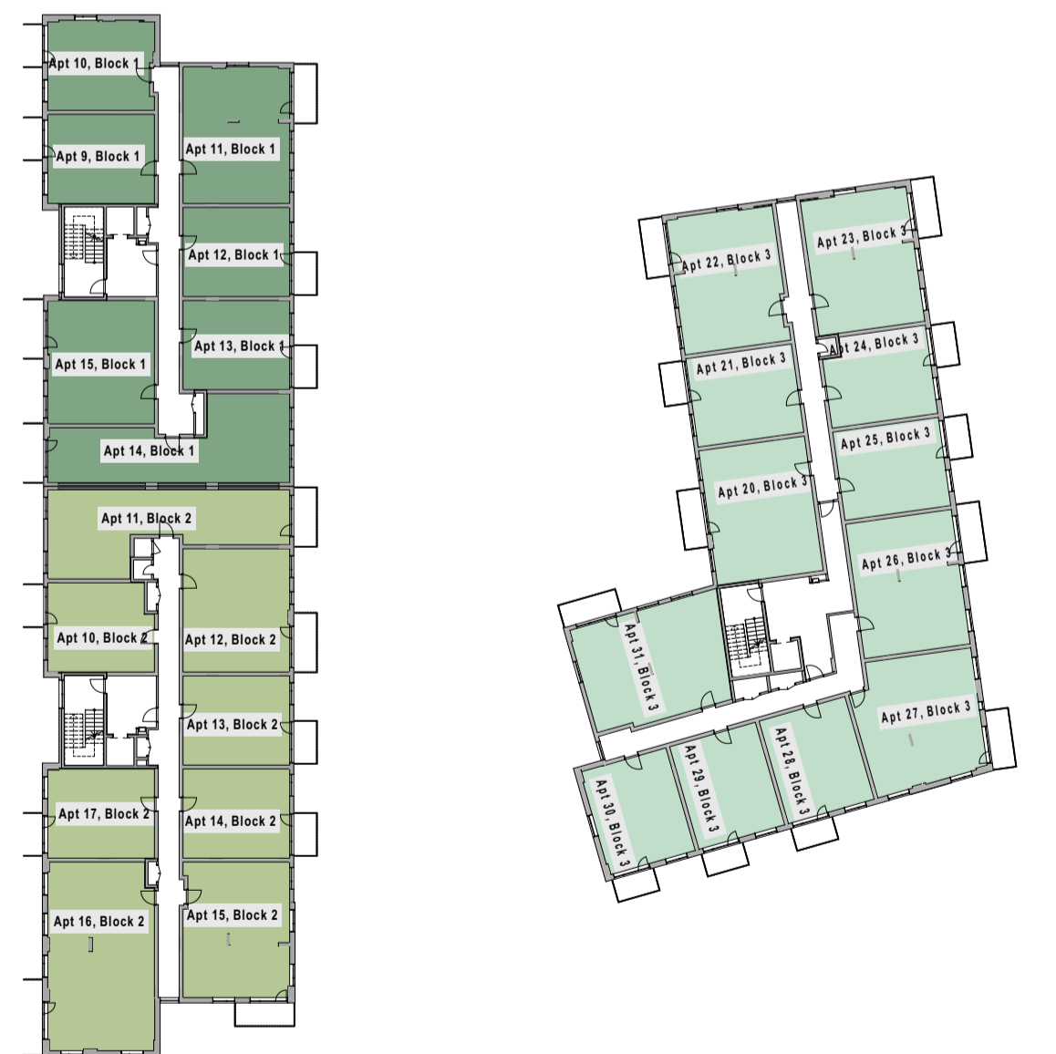
Level 02 Scale:1:500