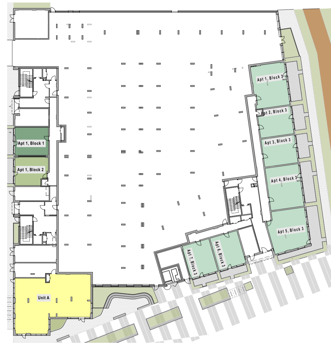
Level 00 Scale:1:500