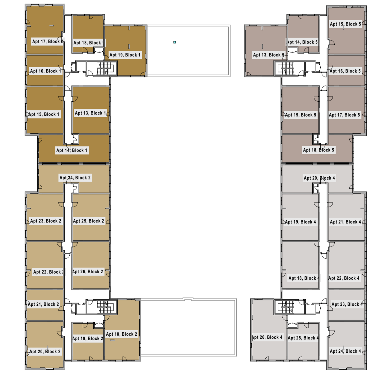
Level 02 Scale:1:500