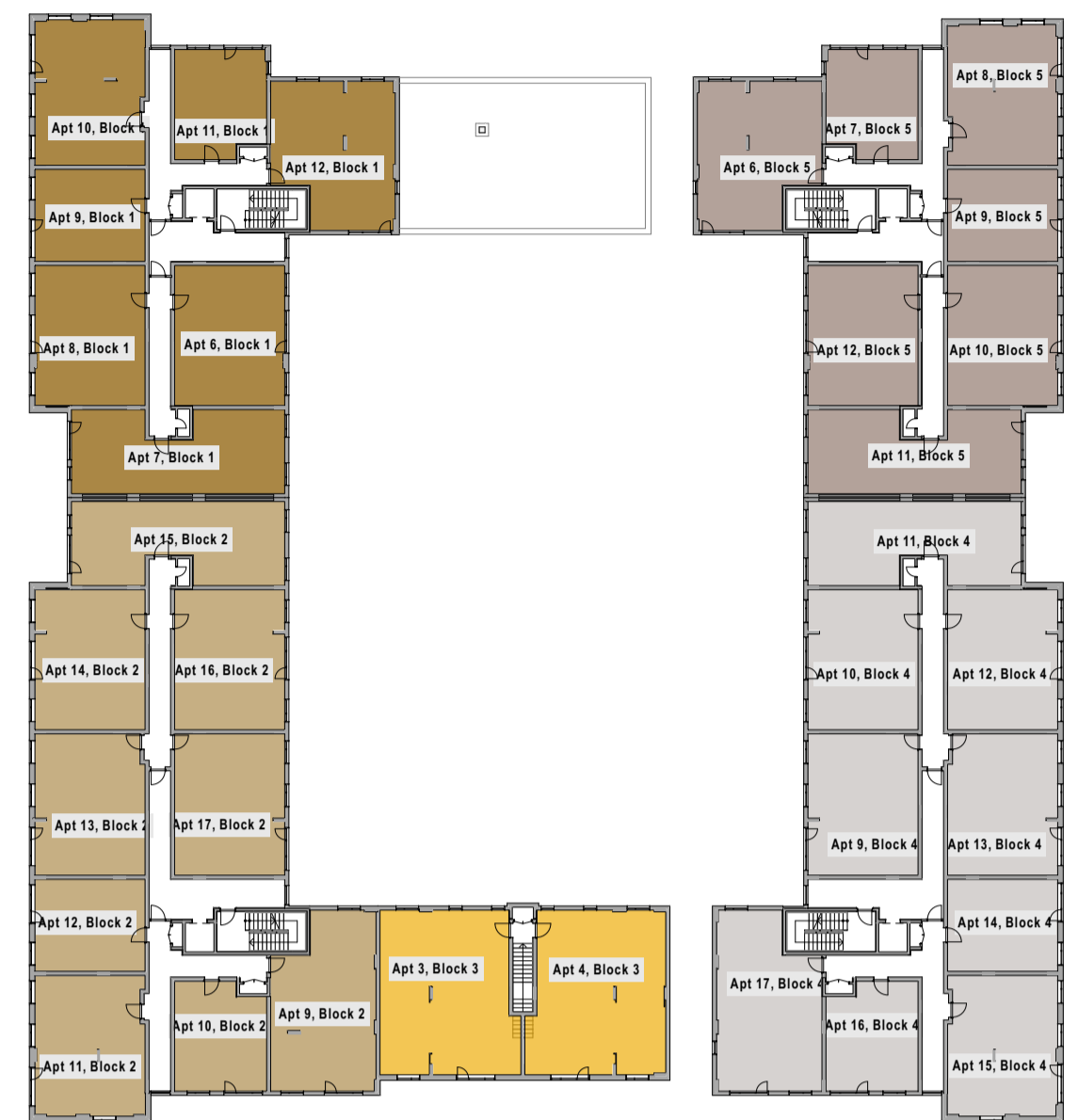
Level 01 Scale:1:500