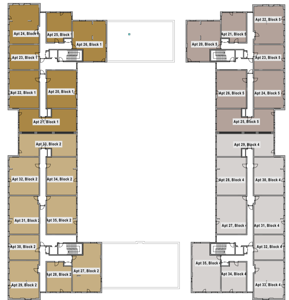
Level 03 Scale:1:500