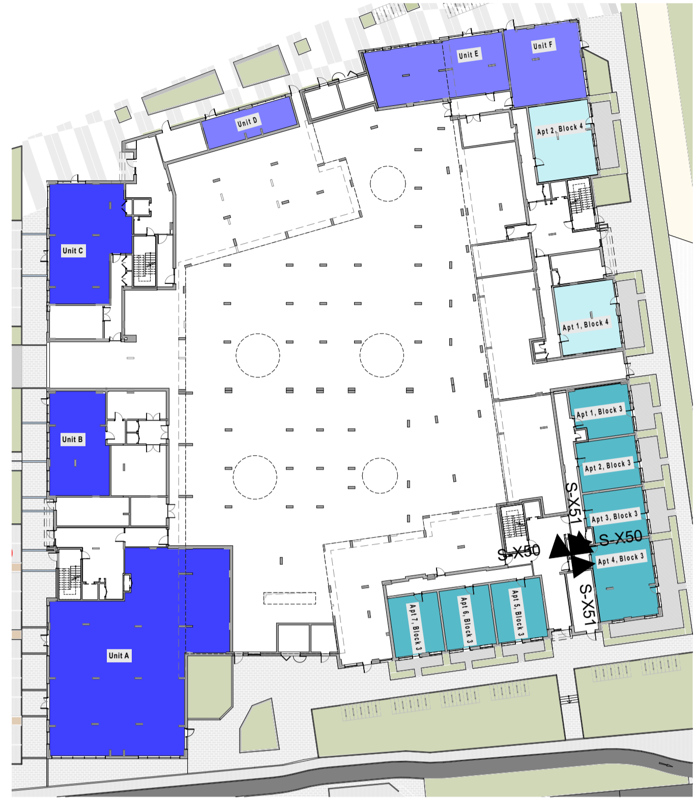
LEVEL 00 Scale:1:500