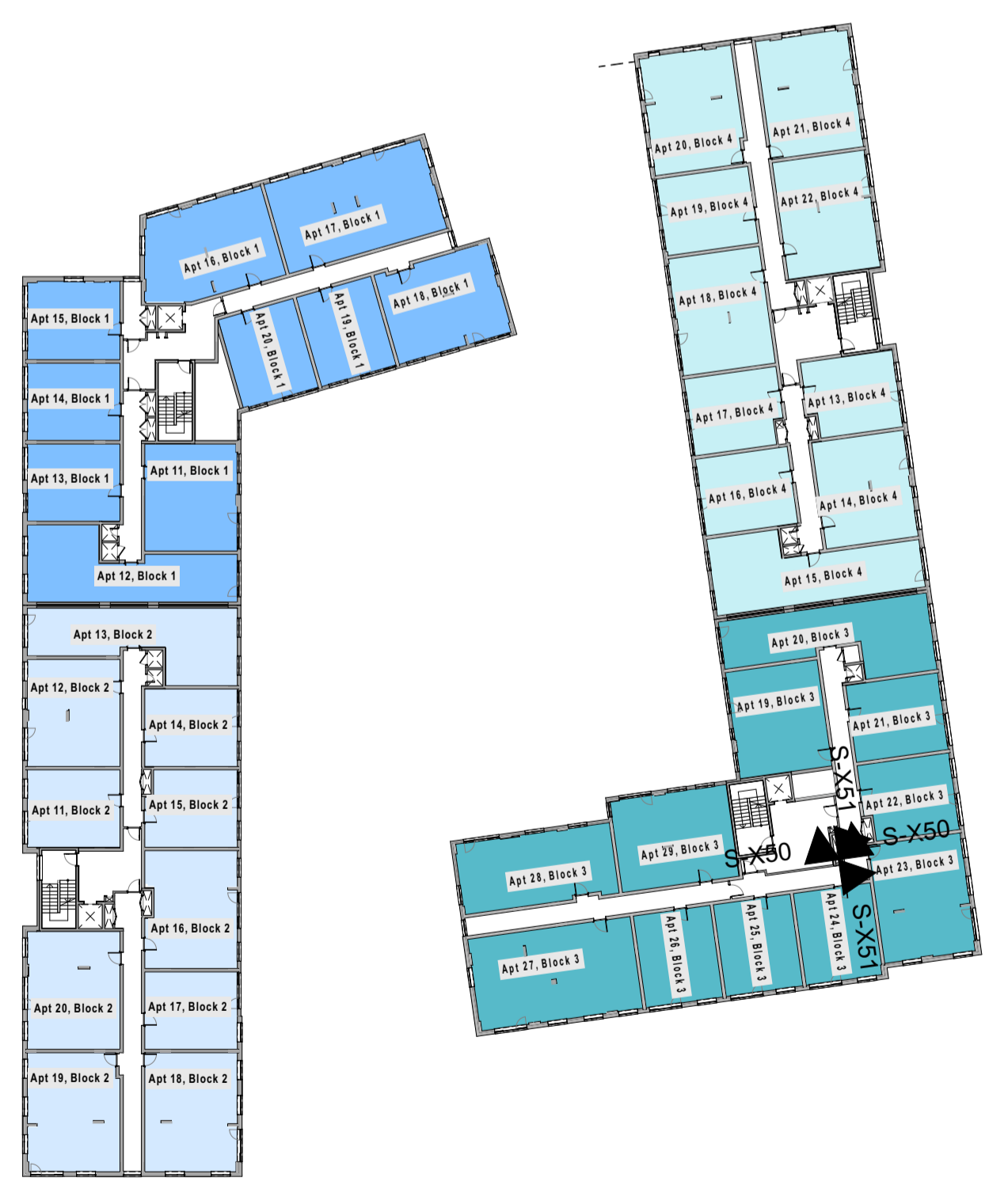
LEVEL 02 Scale:1:500