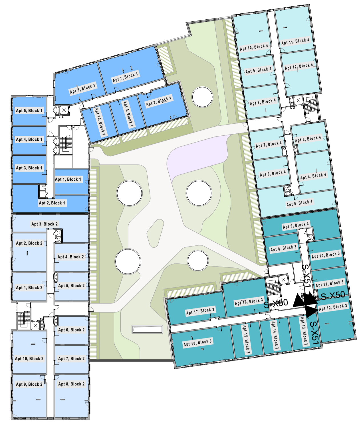
LEVEL 01 Scale:1:500