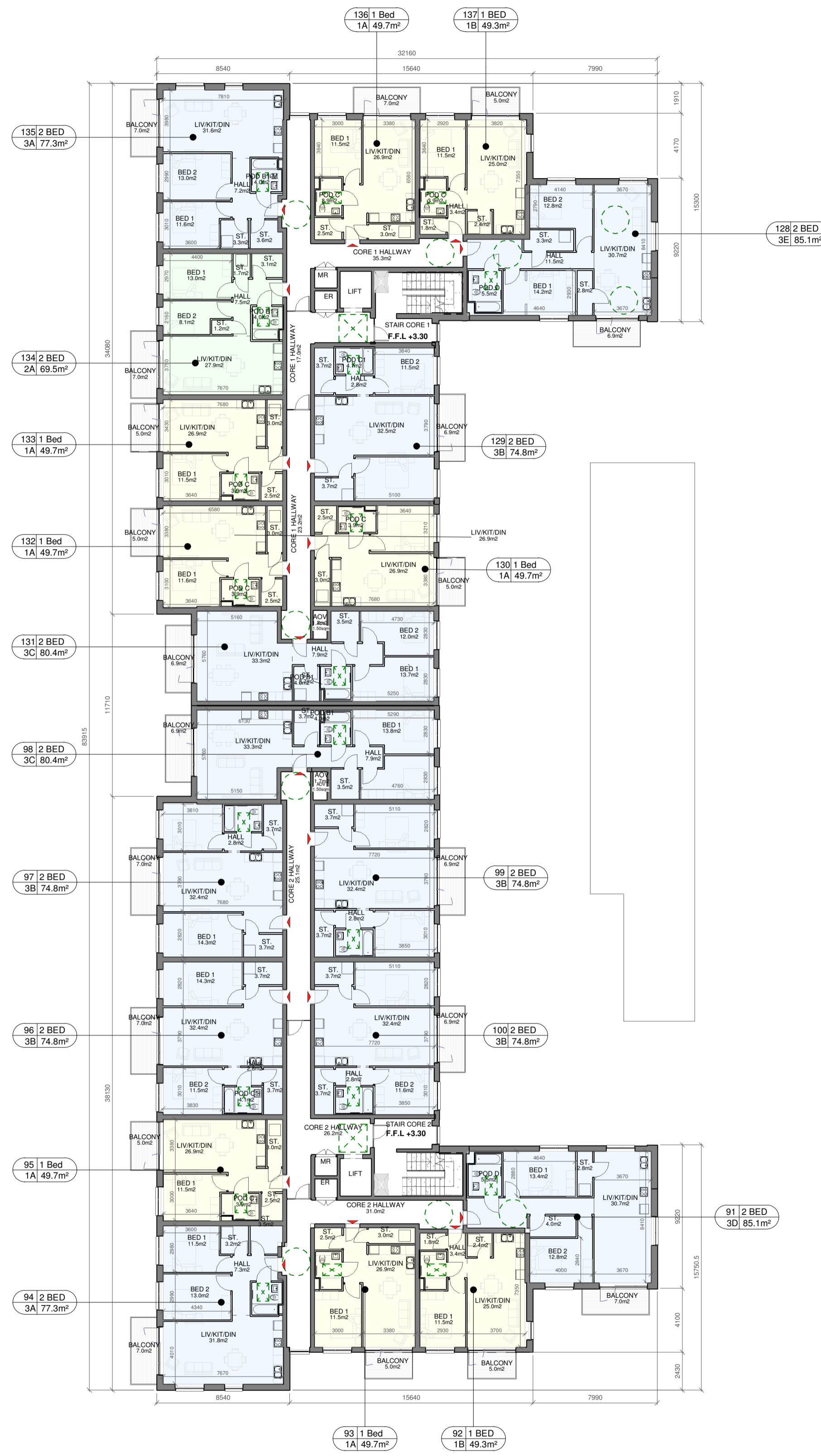
Block 1 - First Floor Plan SCALE: 1 : 200