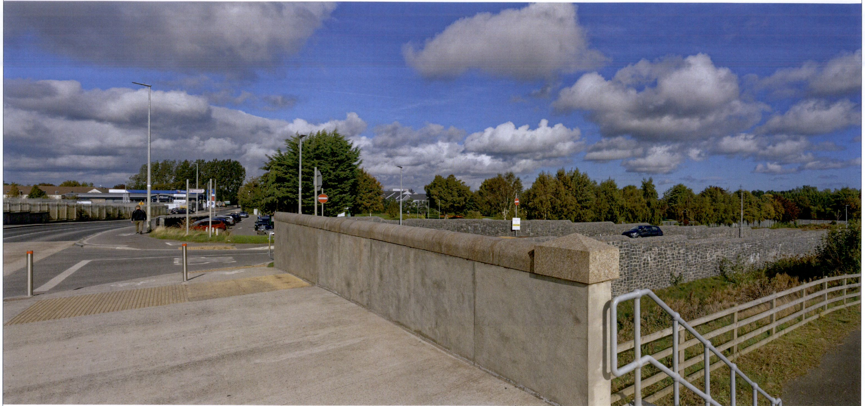
THE IMAGE ABOVE IS A PANORAMA ASSEMBLED FROM TWO OR MORE PHOTOGRAPHS