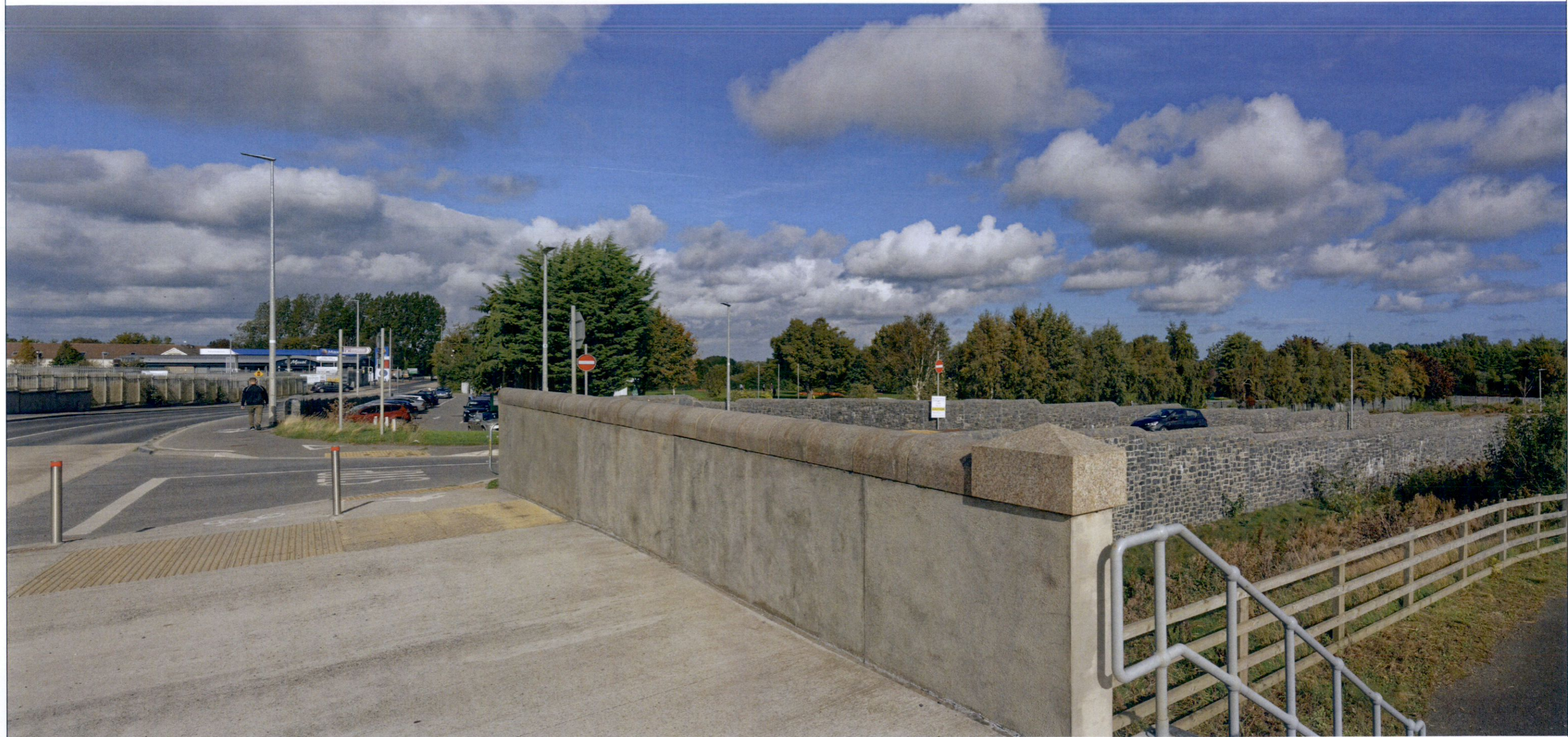
THE IMAGE ABOVE IS A PANORAMA ASSEMBLED FROM TWO OR MORE PHOTOGRAPHS