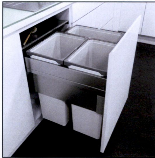
Figure 5.2 Example three bin storage system to be provided within the unit design.

Provision will be made in all residential units to accommodate 3 no. bin types to facilitate waste segregation at source. An example of a potential 3 bin storage system is provided in figure 5.2 below.