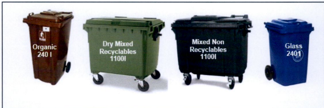
Figure 5.1 Typical waste receptacles of varying size (120L, 240L & 1100L)

The types of bins used will vary in size, design and colour dependent on the appointed waste contractor. However, examples of typical receptacles to be provided in the WSAs are shown in Figure 5.1. All waste receptacles used will comply with SIST EN 840-1:2020 and SIST EN 840-2:2020 standards for performance requirements of mobile waste containers, where appropriate.