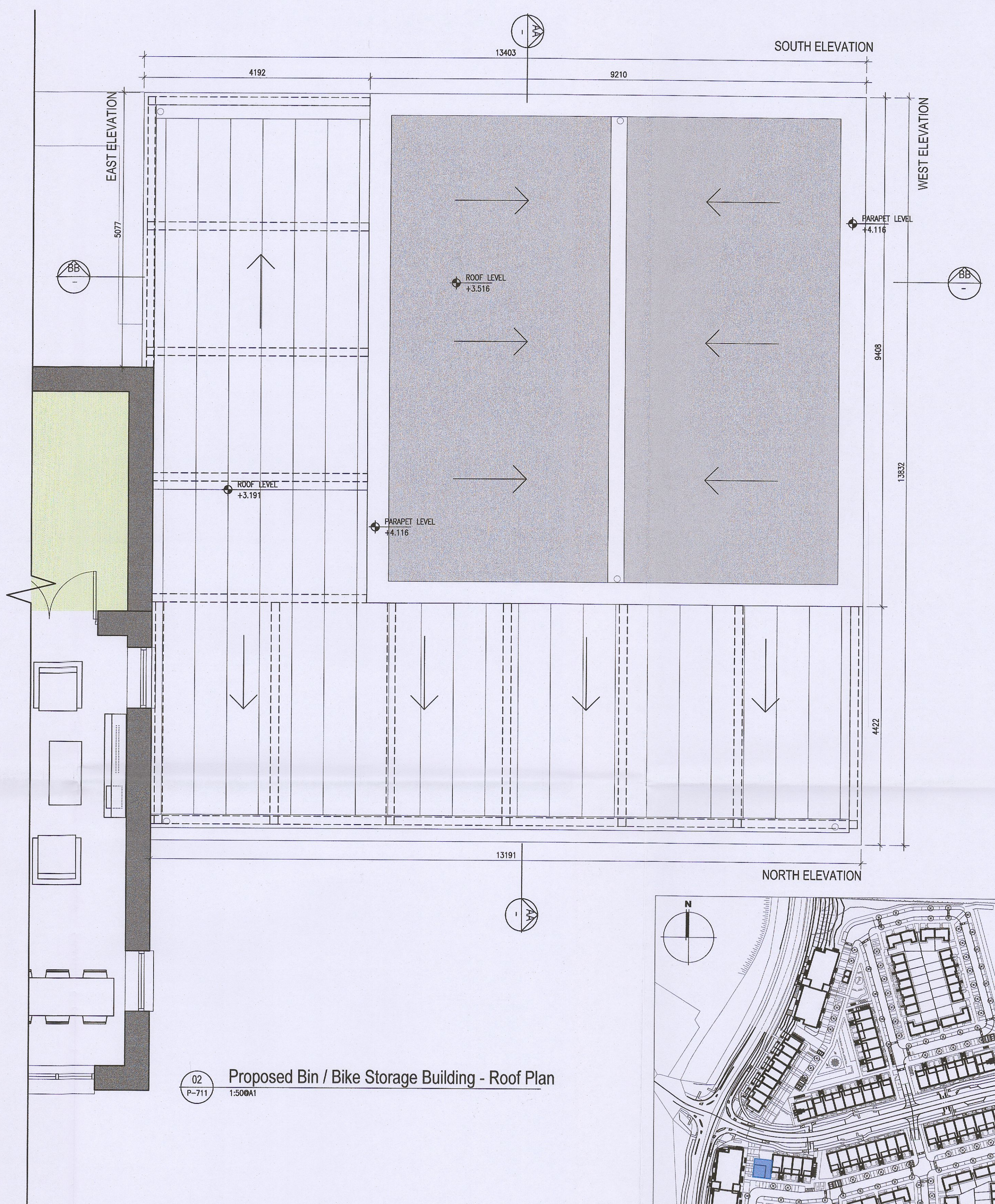
02 Proposed Bin / Bike Storage Building - Roof Plan 1:500A1