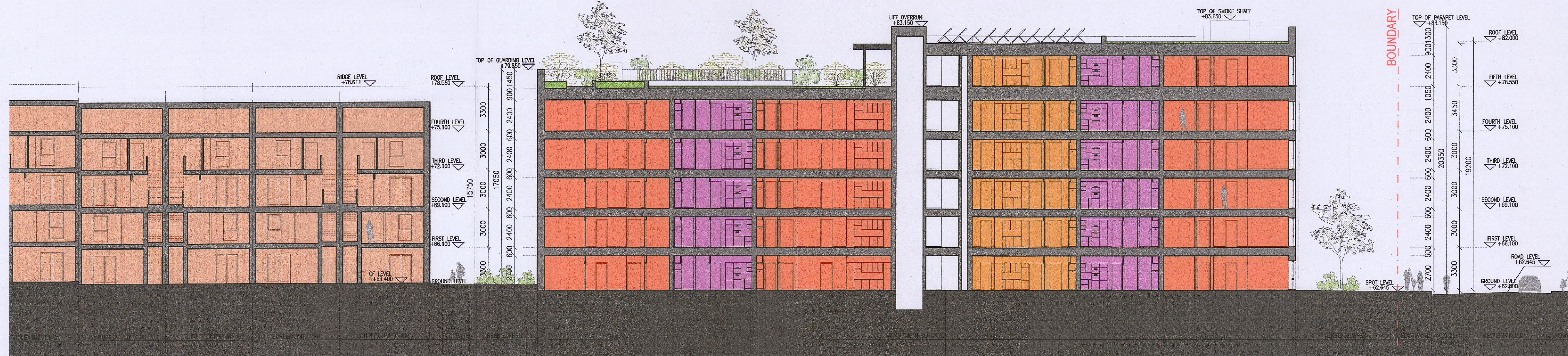
03 Proposed Section C-C 1:200 @ A1