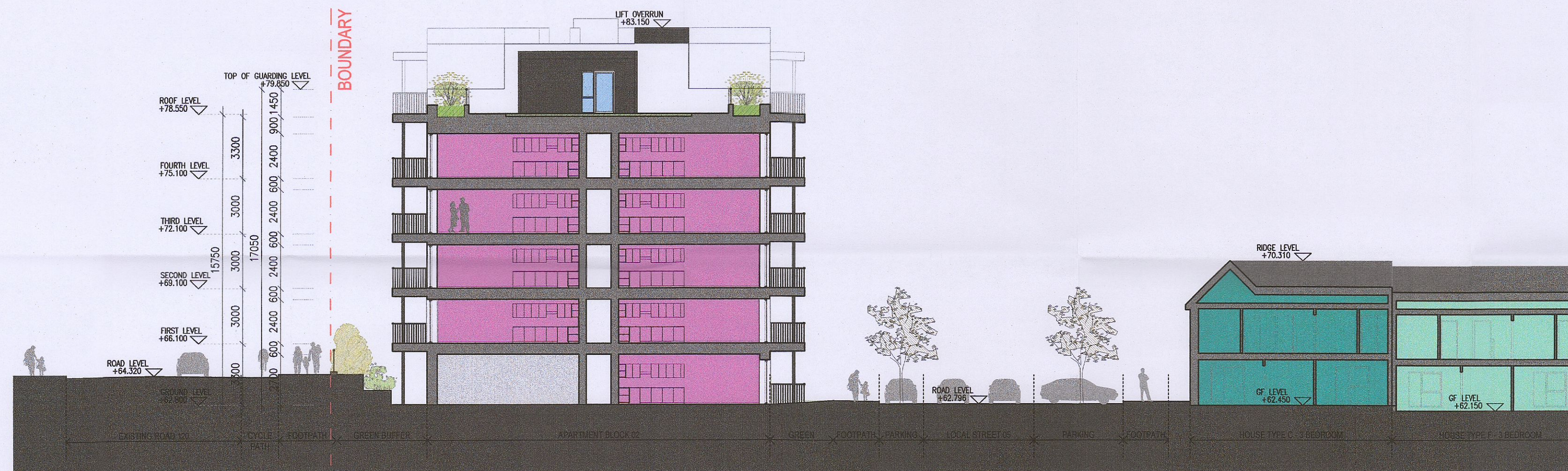
02 Proposed Section B-B 1:200 @ A1