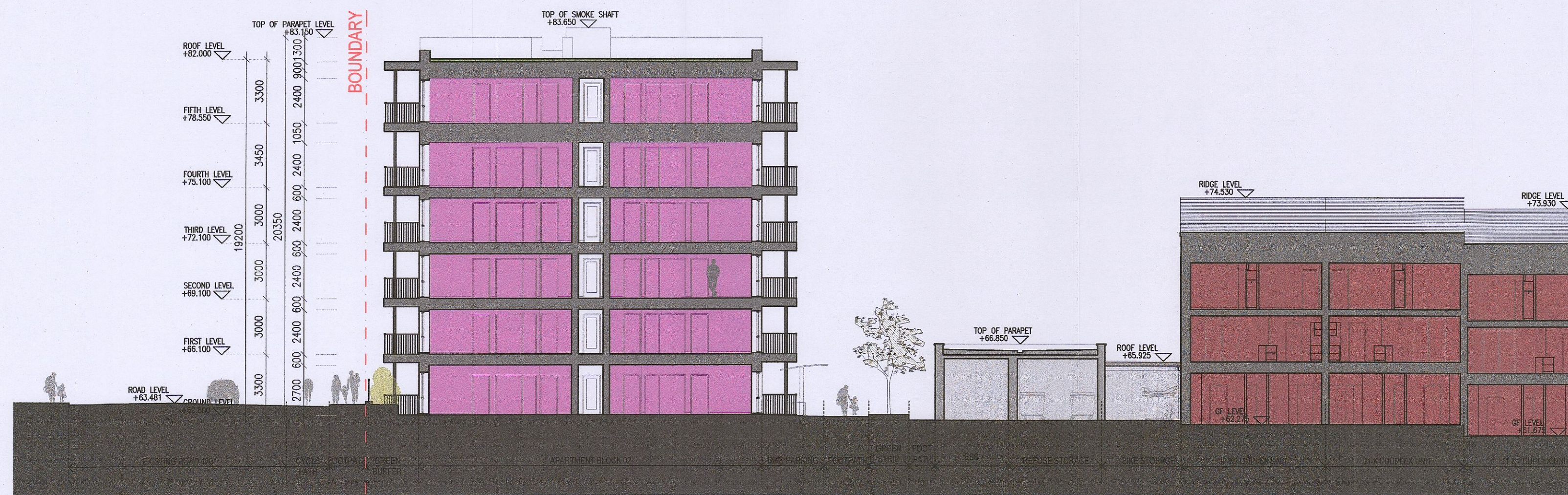
01 Proposed Section A-A 1:200 @ A1