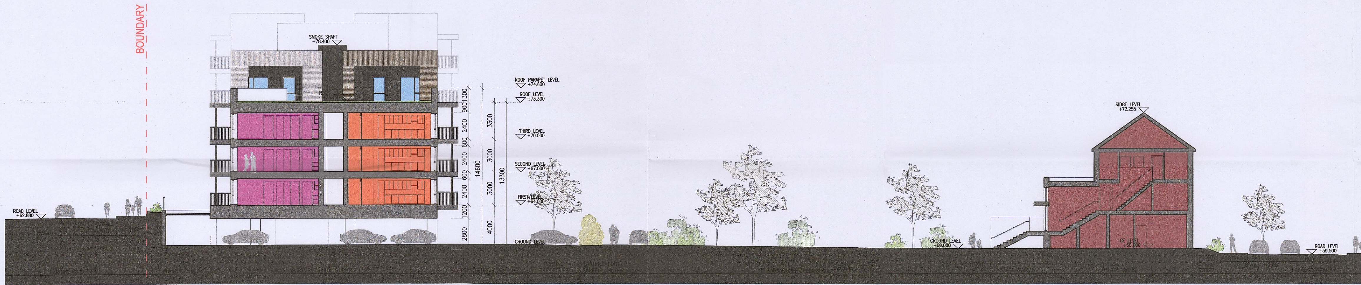
02 Proposed Section B-B P-500 1:200 @ A1