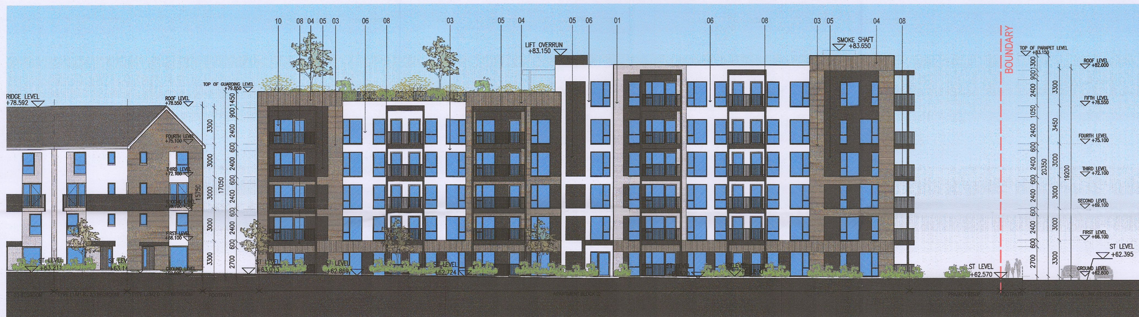
03 Proposed South Elevation P-400 1:200 @ A1