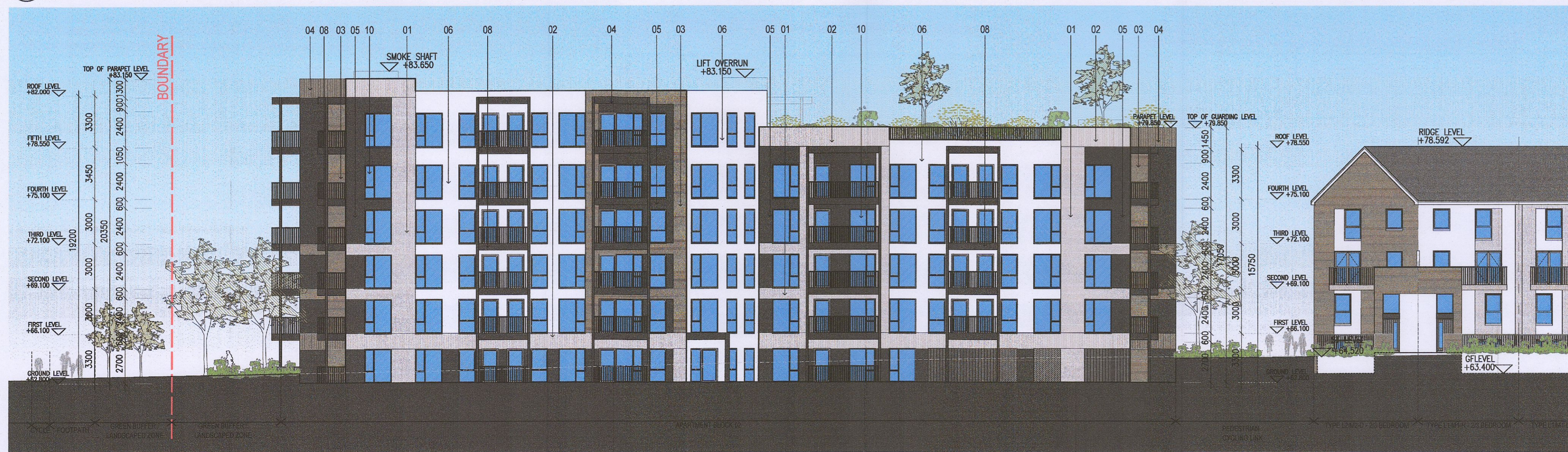
04 Proposed East Elevation P-400 1:200 @ A1