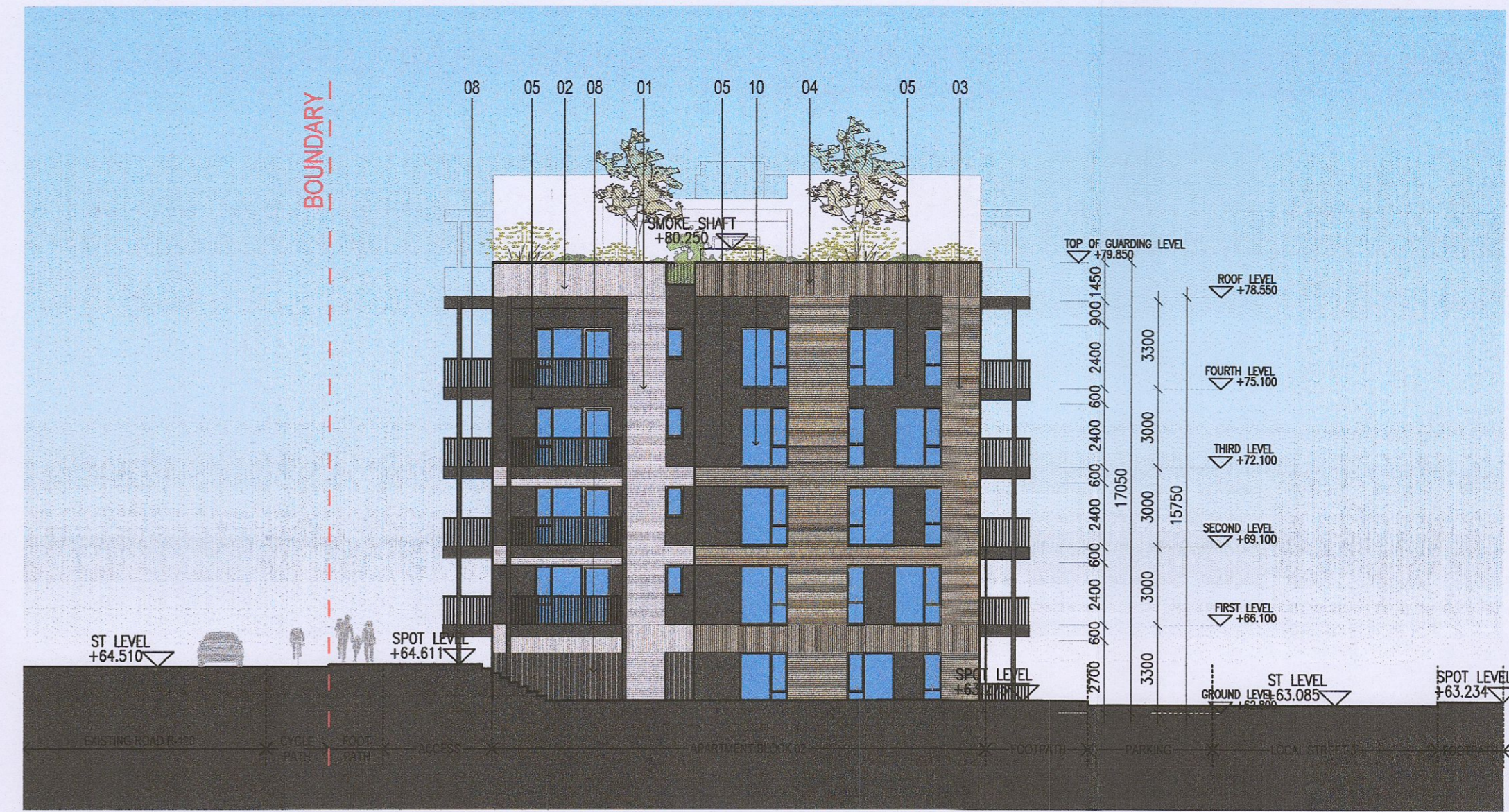
02 Proposed South-West Elevation P-400 1:200 @ A1