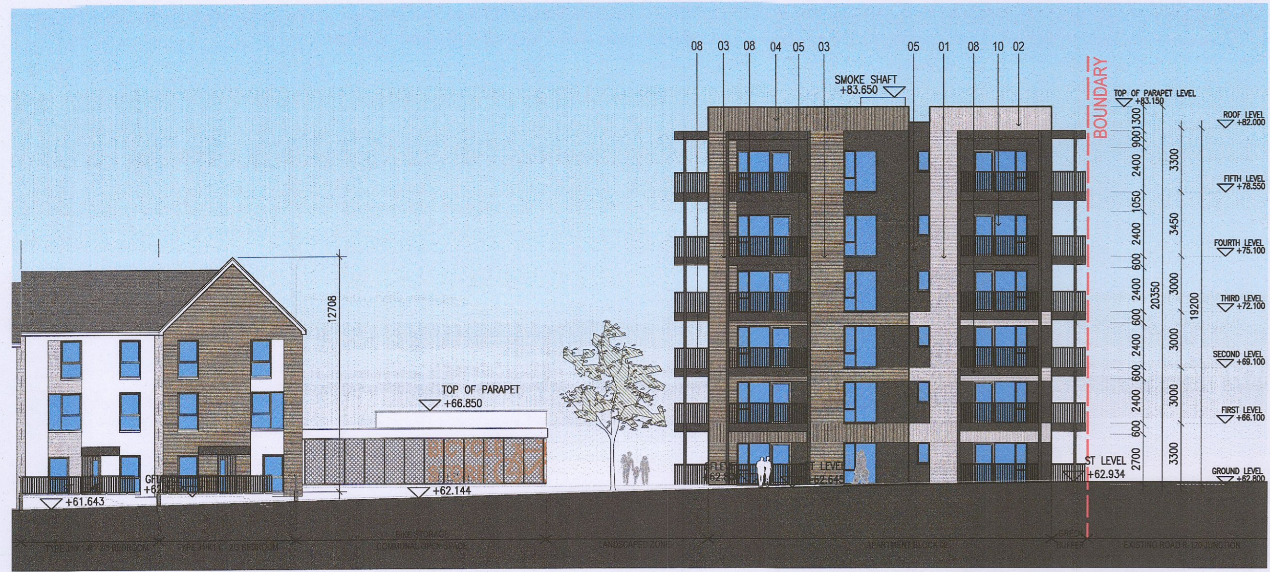
01 Proposed South-West Elevation P-400 1:200 @ A1