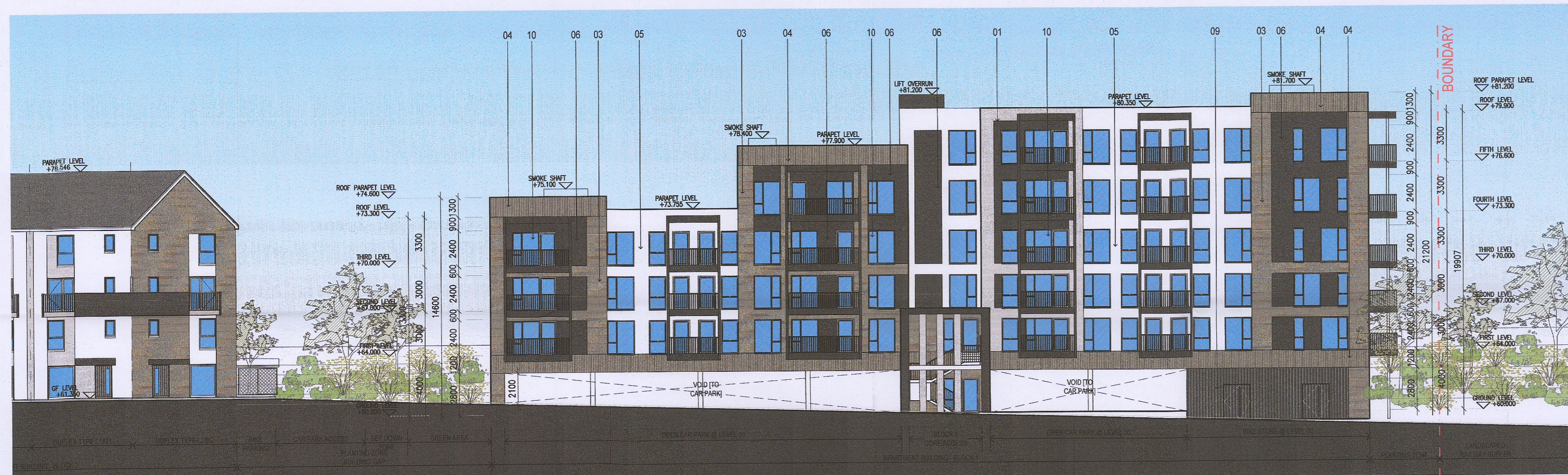
03 Proposed East Elevation P-400 1:200 @ A1