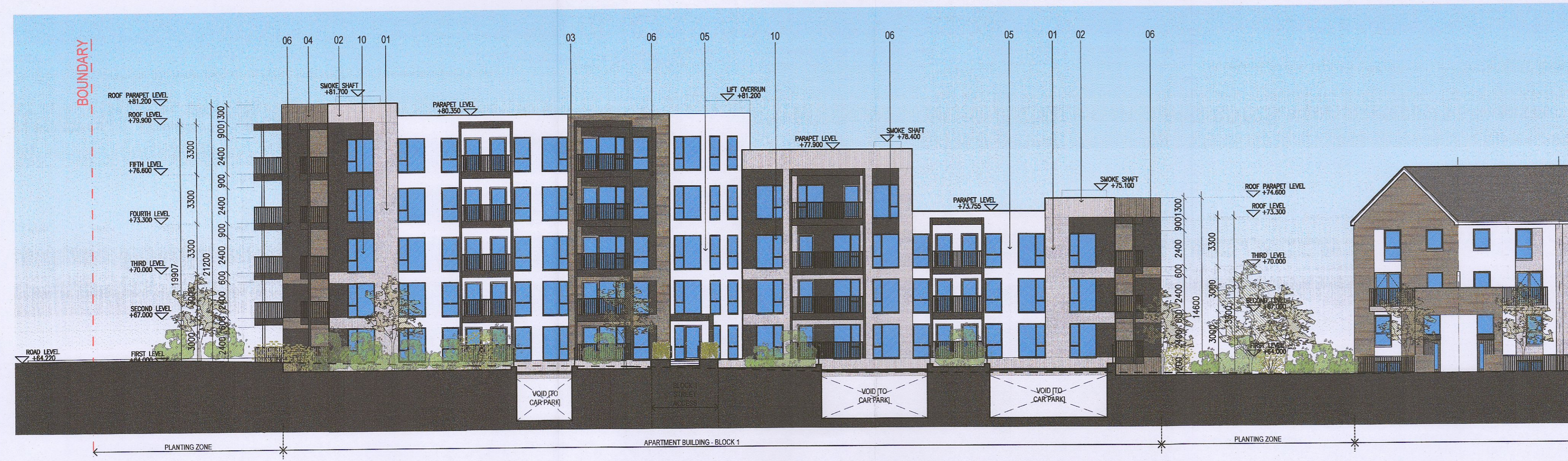
04 Proposed West Elevation P-400 1:200 @ A1