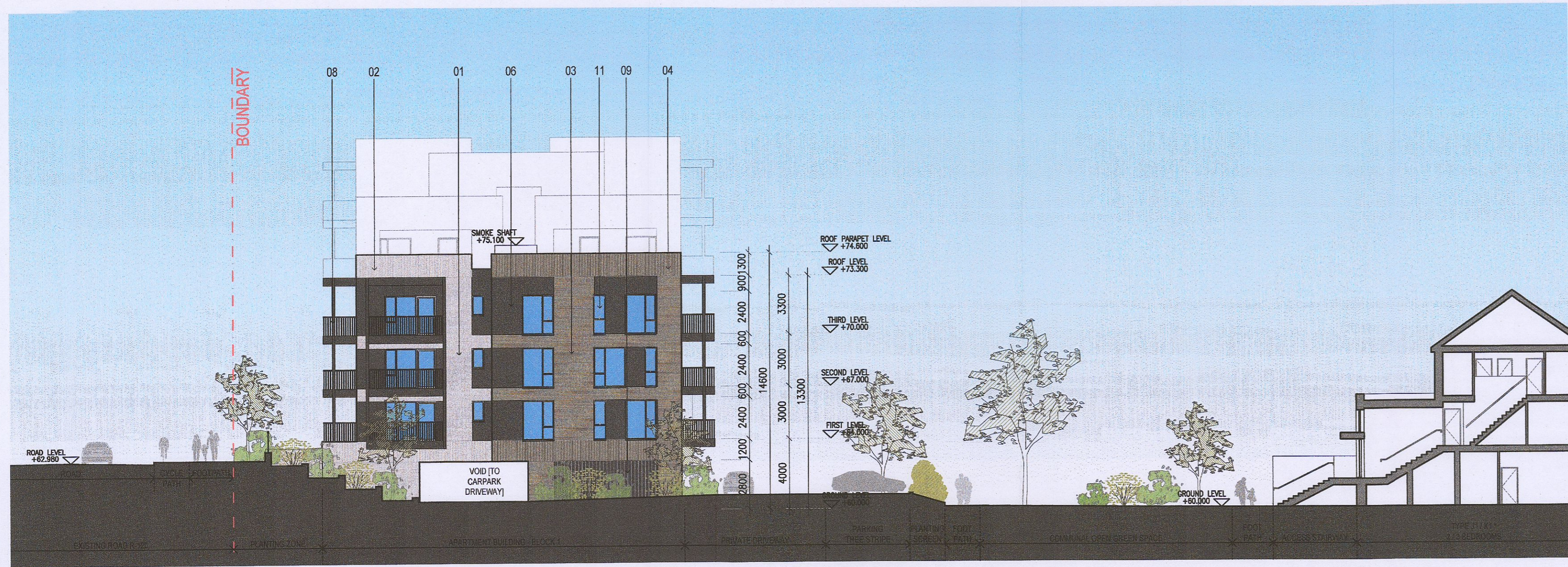
01 Proposed South Elevation P-400 1:200 @ A1