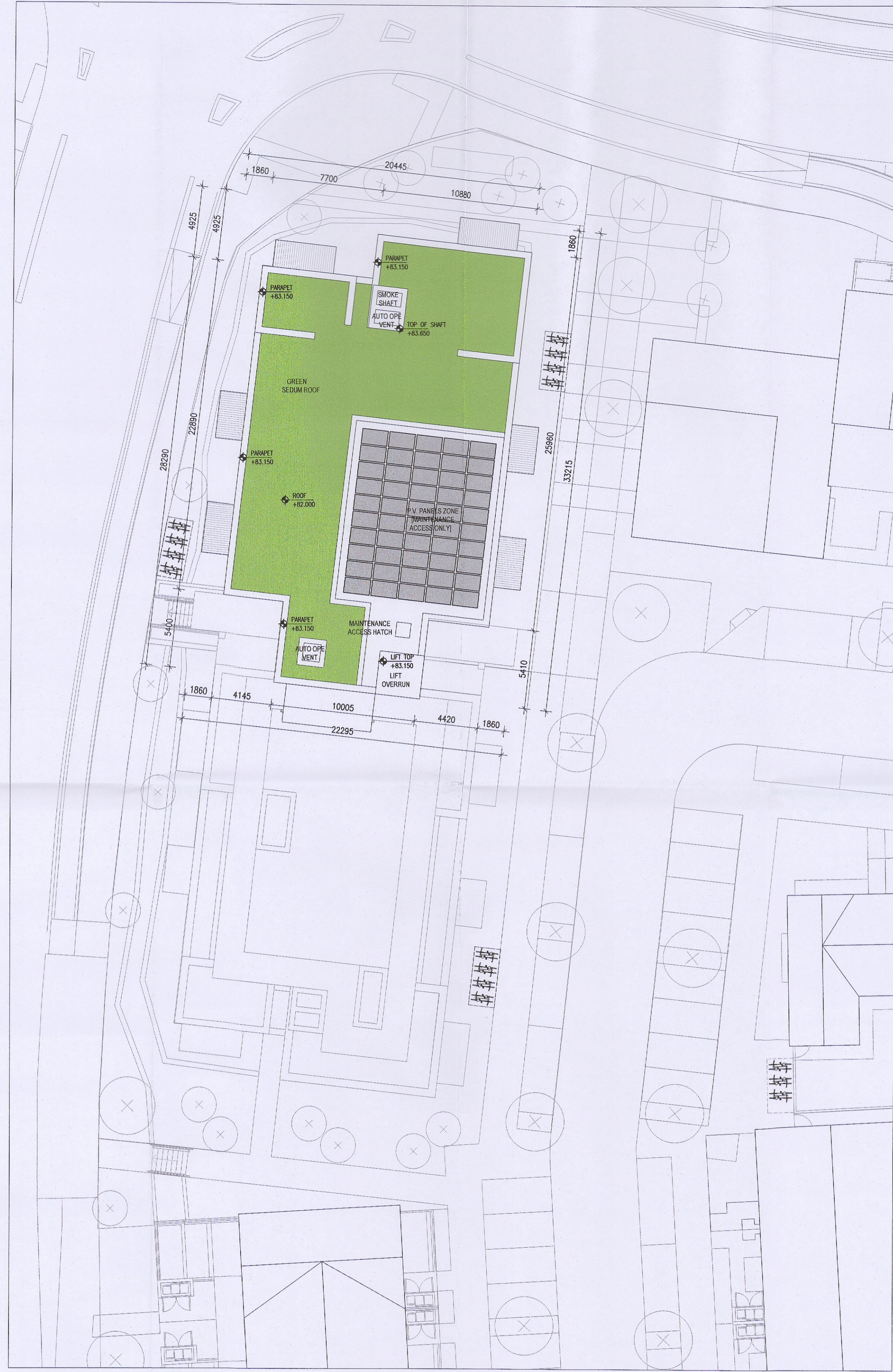
02 Block 02 Level 06 Floor Plan P-307 1:200

Notes: 1. Copyright Reserved 2. Work to figured dimensions only. Do not scale drawing. 3. The contractor is responsible for checking all levels and dimensions on site and shall refer all discrepancies to the Architect 4. Where appropriate, for details of r.c. structure, or mechanical and electrical details, see Engineers drawings 5. Proprietary items shall be fixed in strict accordance with manufacturers instructions. 6. Sizes of proprietary items shall be checked with manufacturer. 7. The contractor shall be responsible for the coordination of structure, finishes and services.