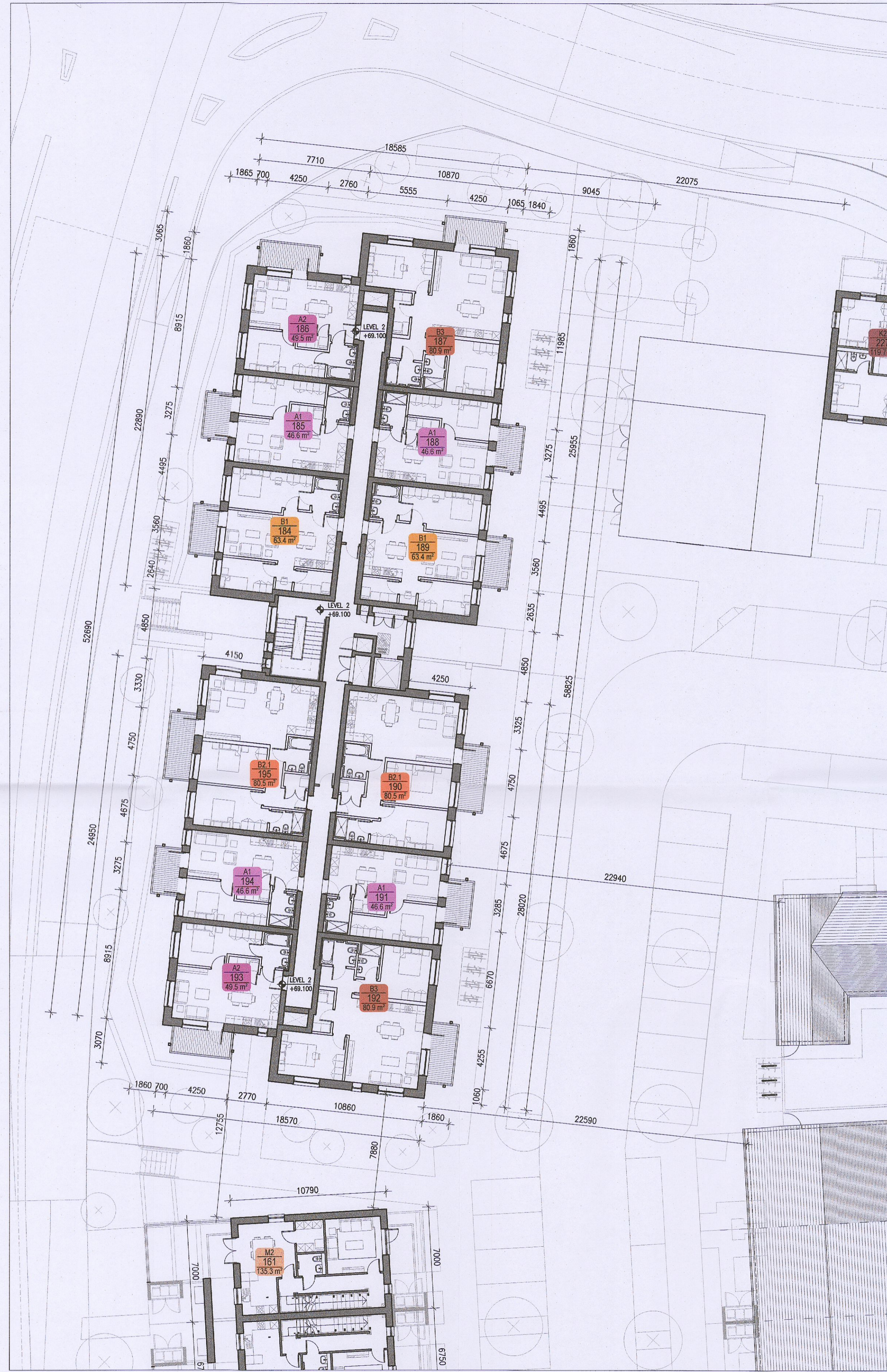
02 Block 02 Level 02 Floor Plan P-305 1:200