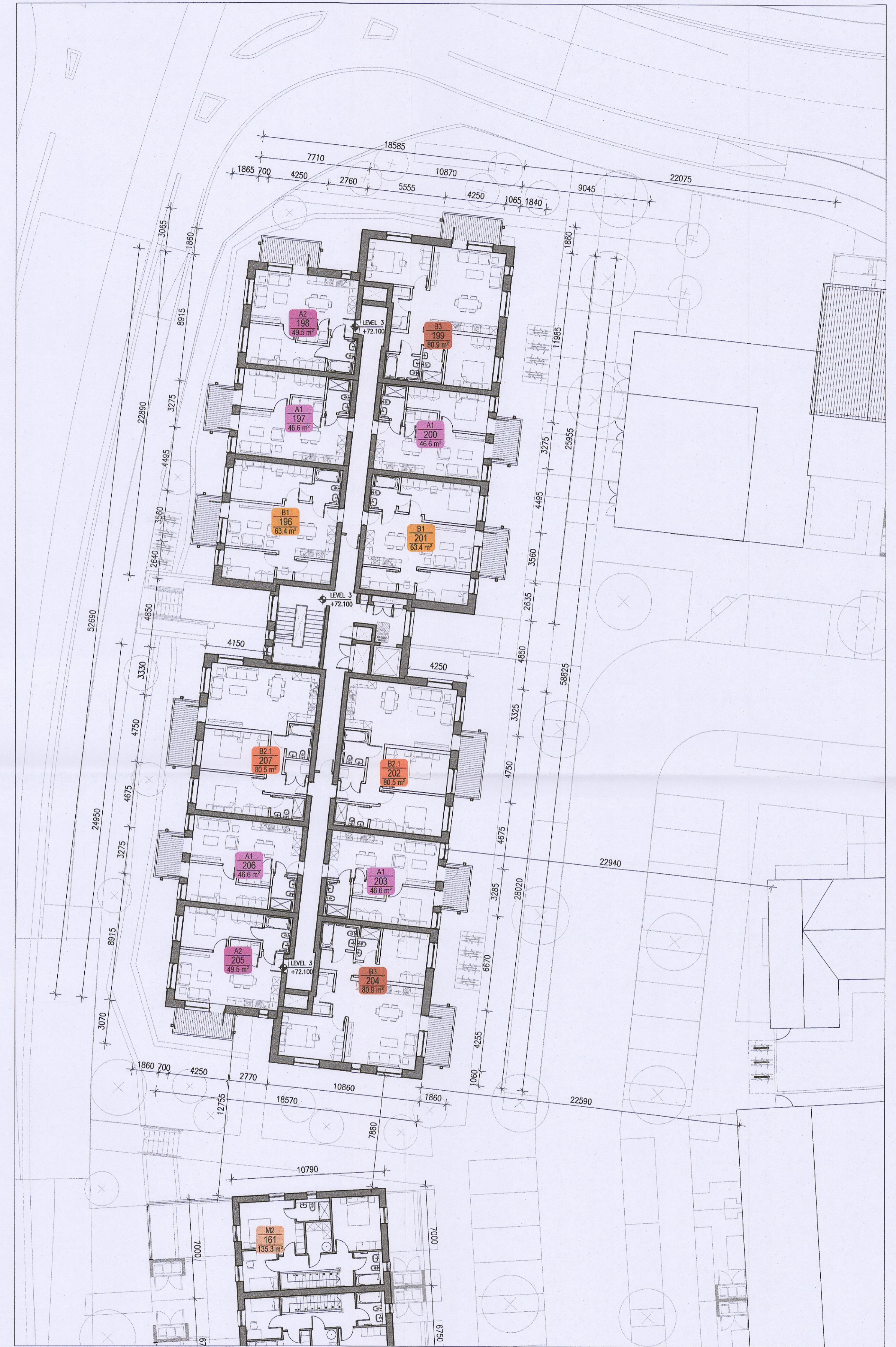
03 Block 02 Level 03 Floor Plan P-305 1:200

Notes 1. Copyright Reserved 2. Work to signed dimensions only. Do not scale drawing. 3. The contractor is responsible for checking all levels and dimensions on site and shall refer all discrepancies to the Architect. 4. Where appropriate, for details of r.c. structure, or mechanical and electrical details, see Engineers drawings. 5. Proprietary items shall be fixed in strict accordance with manufacturers instructions. 6. Sizes of proprietary items shall be checked with manufacturer. 7. The contractor shall be responsible for the coordination of structure, finishes and services.