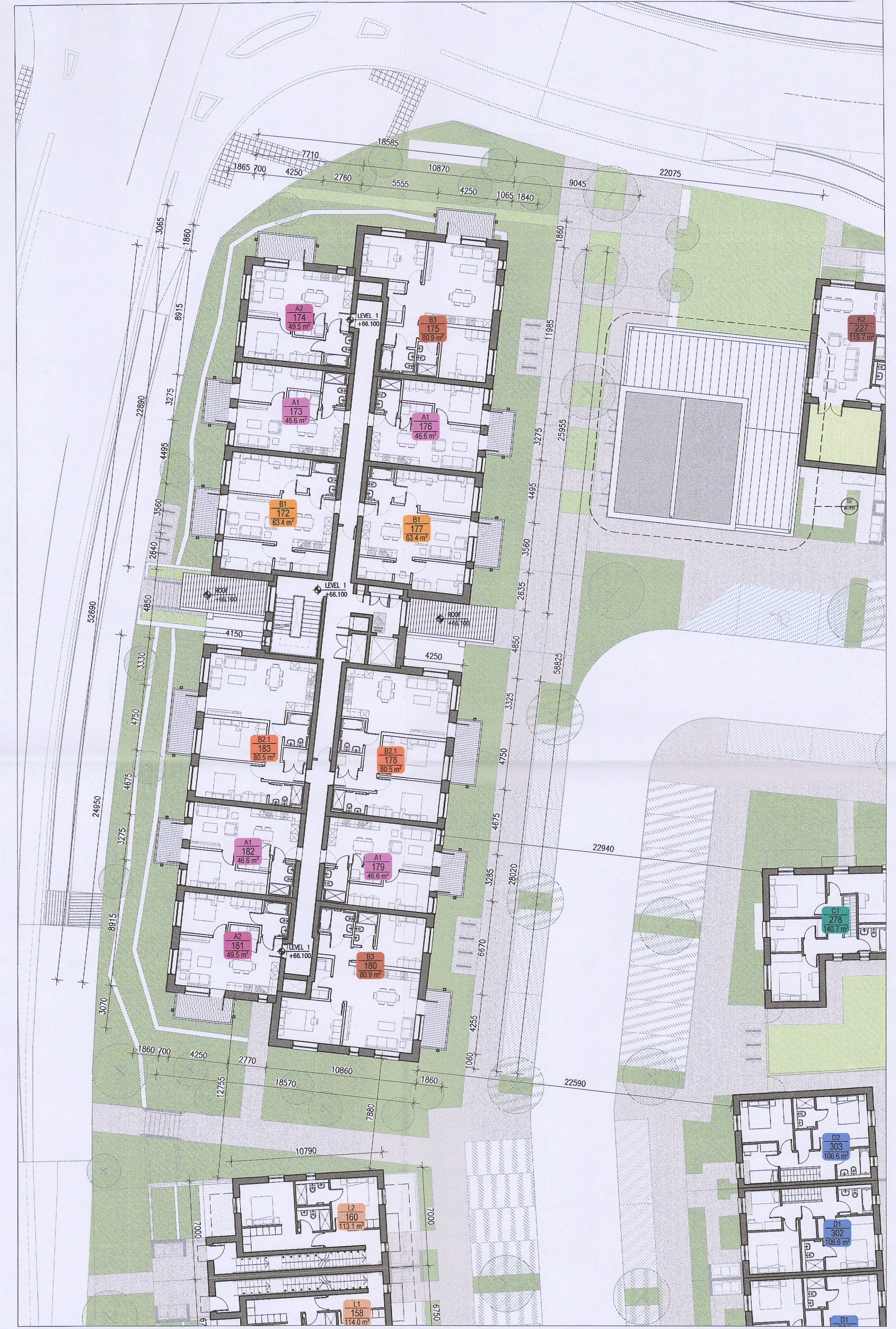
03 Block 02 Level 01 Floor Plan P-304 1:200

Notes 1. Copyright Reserved 2. Work to figured dimensions only. Do not scale drawing 3. The contractor is responsible for checking all levels and dimensions on site and shall refer all discrepancies to the Architect 4. Where appropriate, for details of r.c. structures, or mechanical and electrical details, see Engineers drawings 5. Proprietary items shall be fixed in strict accordance with manufacturers instructions. 6. Sizes of proprietary items shall be checked with manufacturer. 7. The contractor shall be responsible for the coordination of structure, finishes and services. 8. Proposed Plans.dwg 01/11/2023 16:48:04