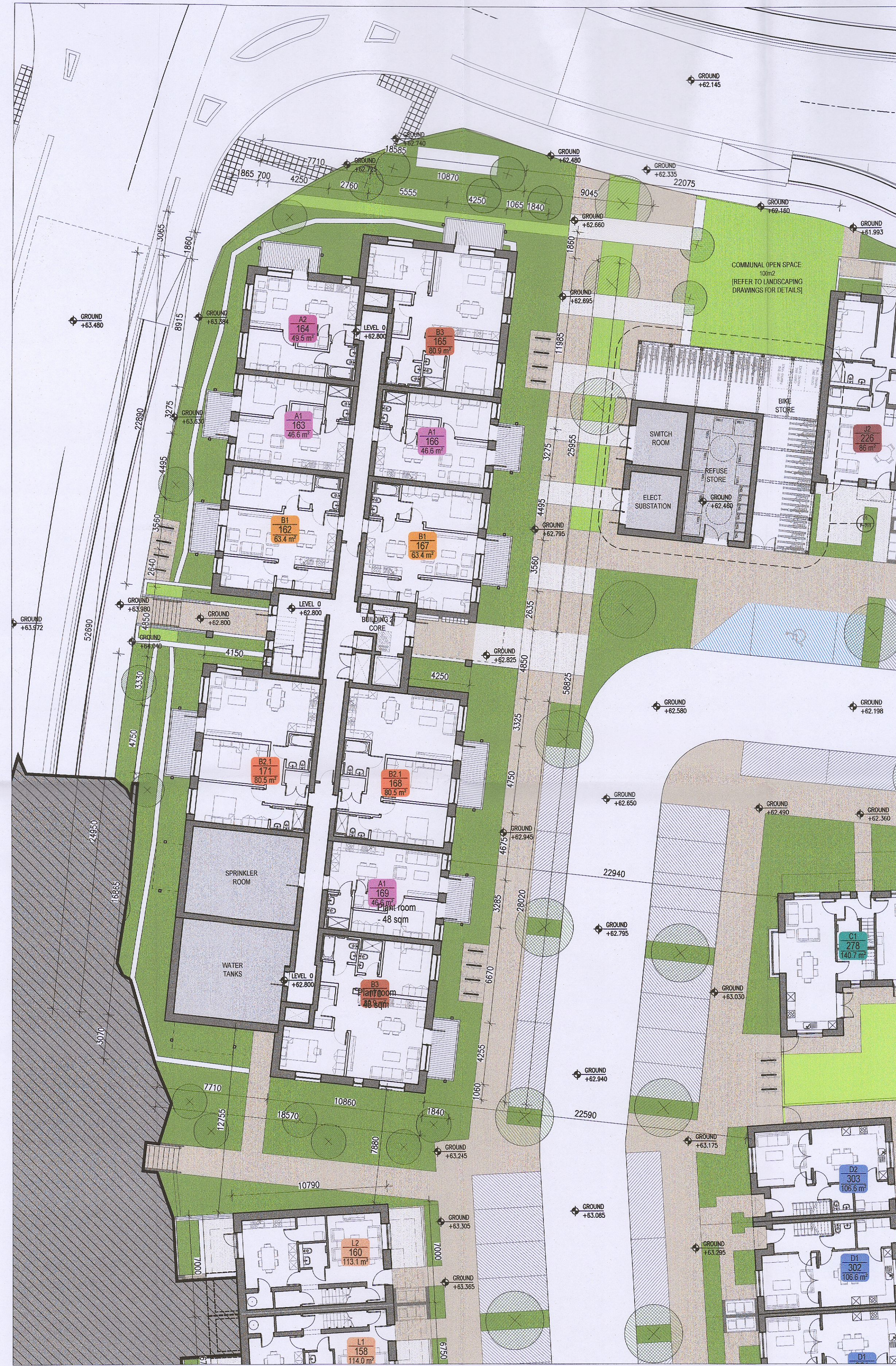
02 Block 02 Level 00 Floor Plan P-304 1:200