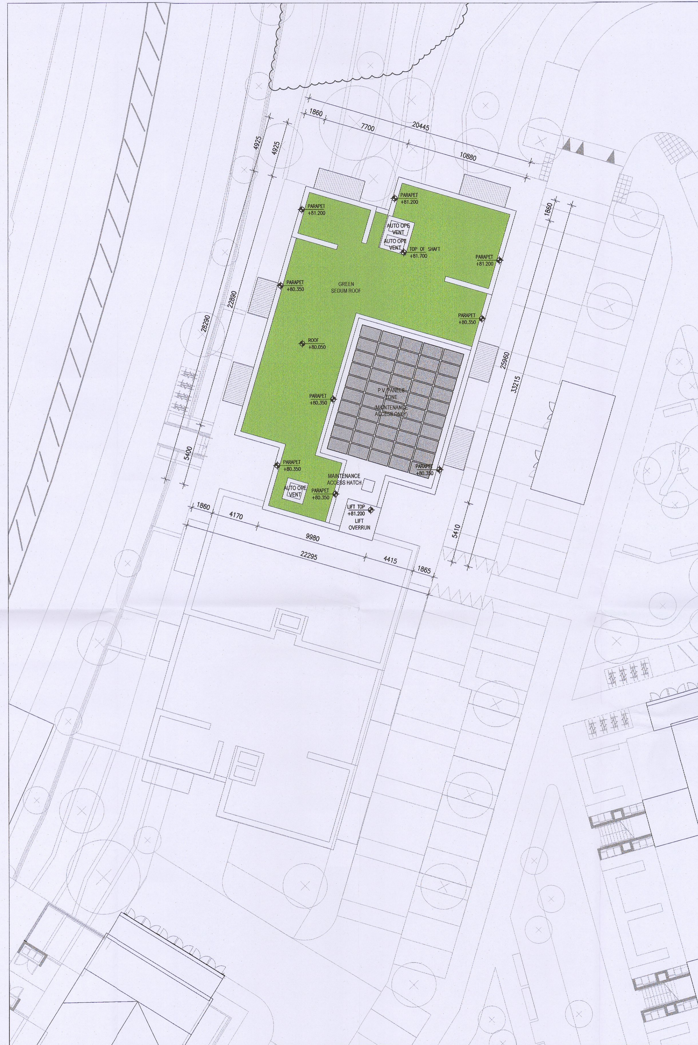
02 Block 01 Level 06 Roof Plan P-303 1:200