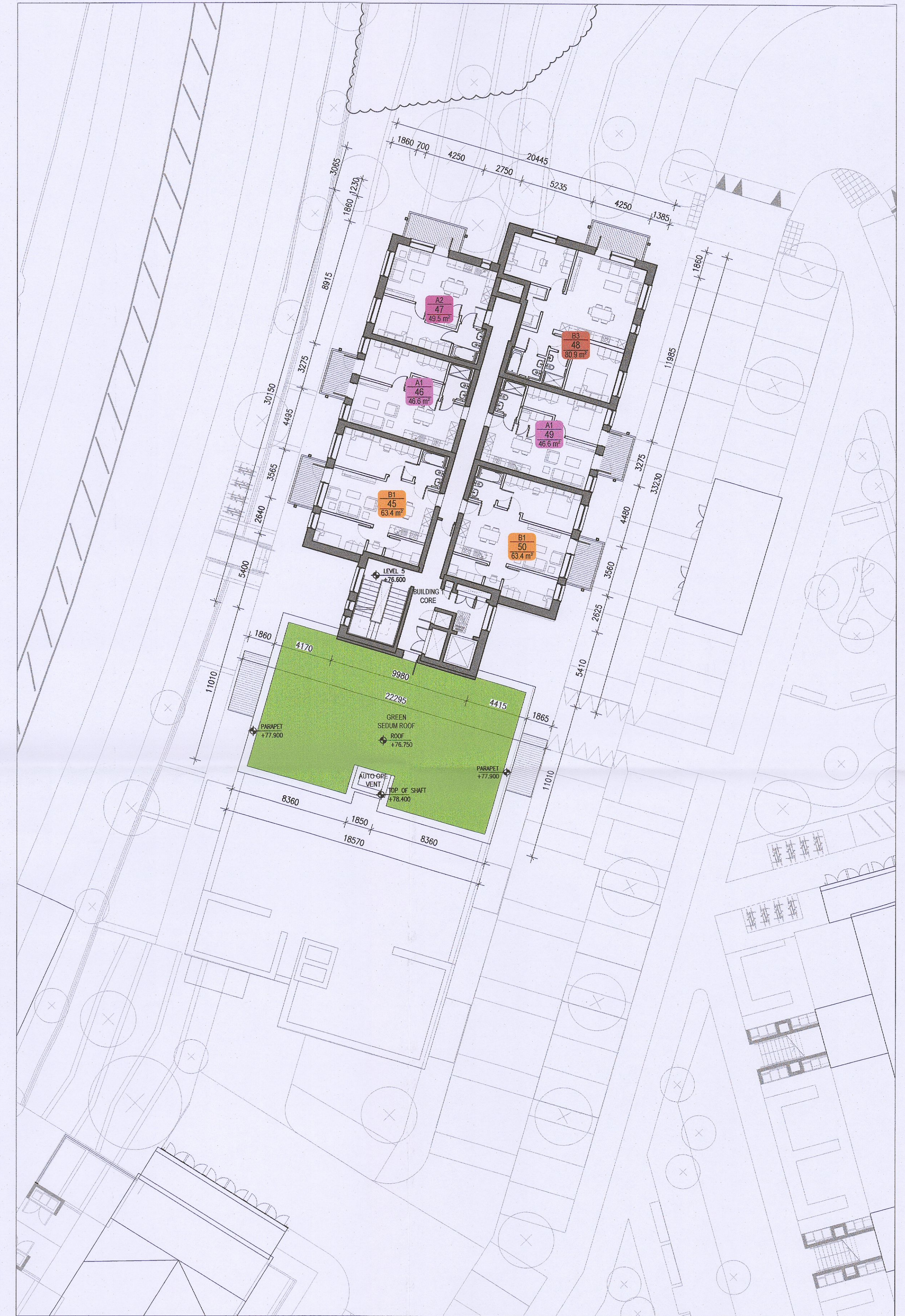
03 Block 01 Level 05 Floor Plan P-300 1:200