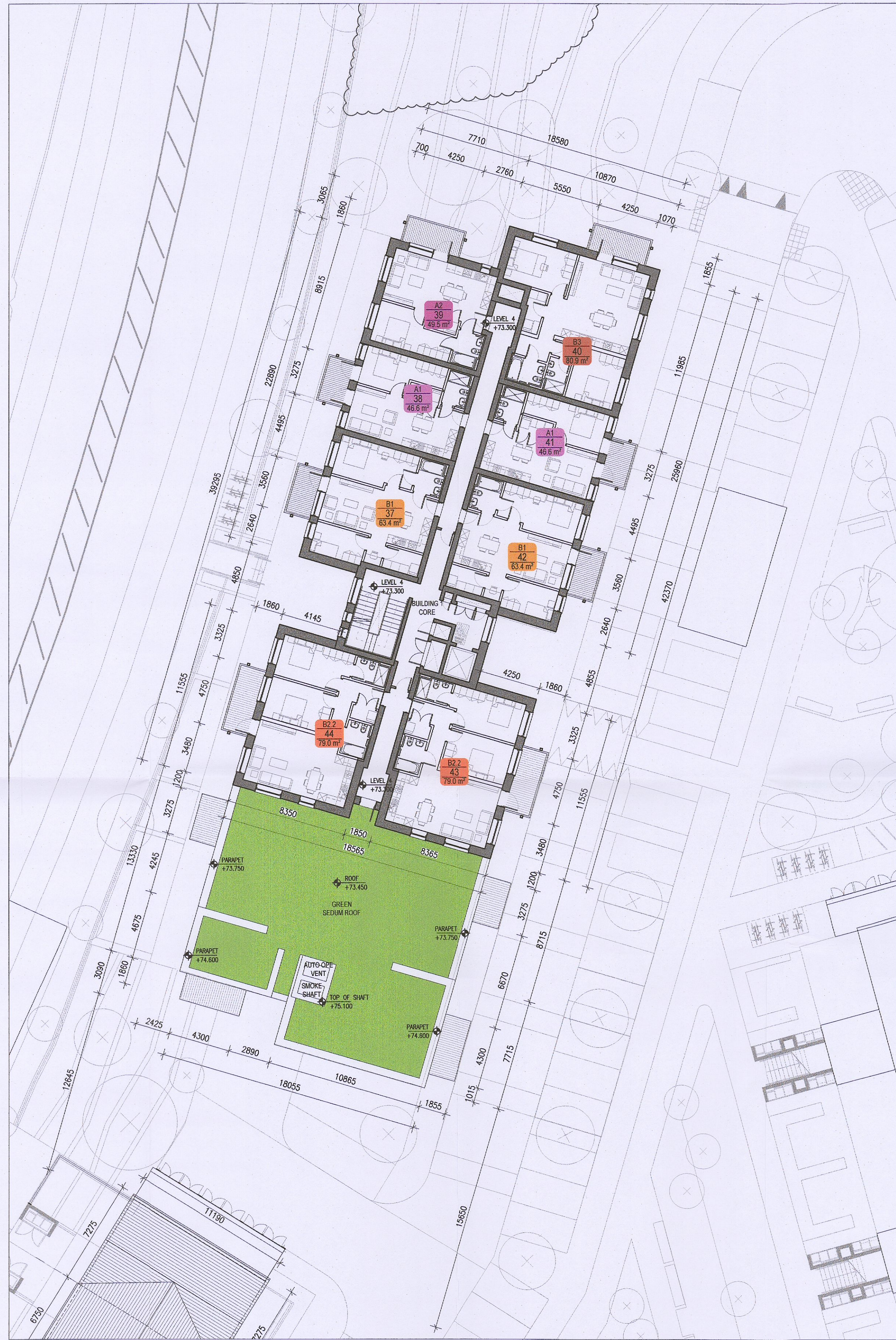
02 Block 01 Level 04 Floor Plan P-300 1:200