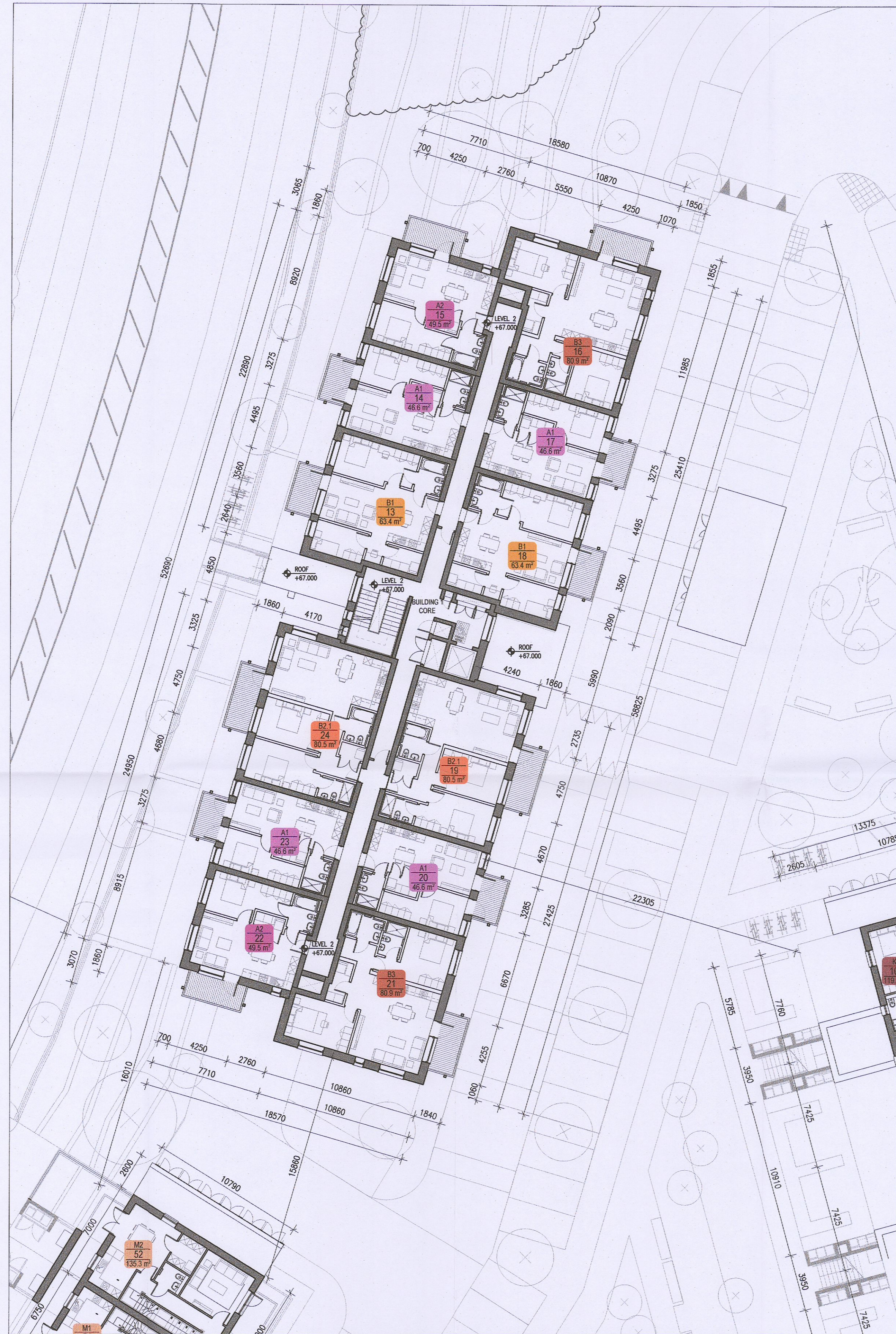
02 Block 01 Level 02 Floor Plan P-301 1:200