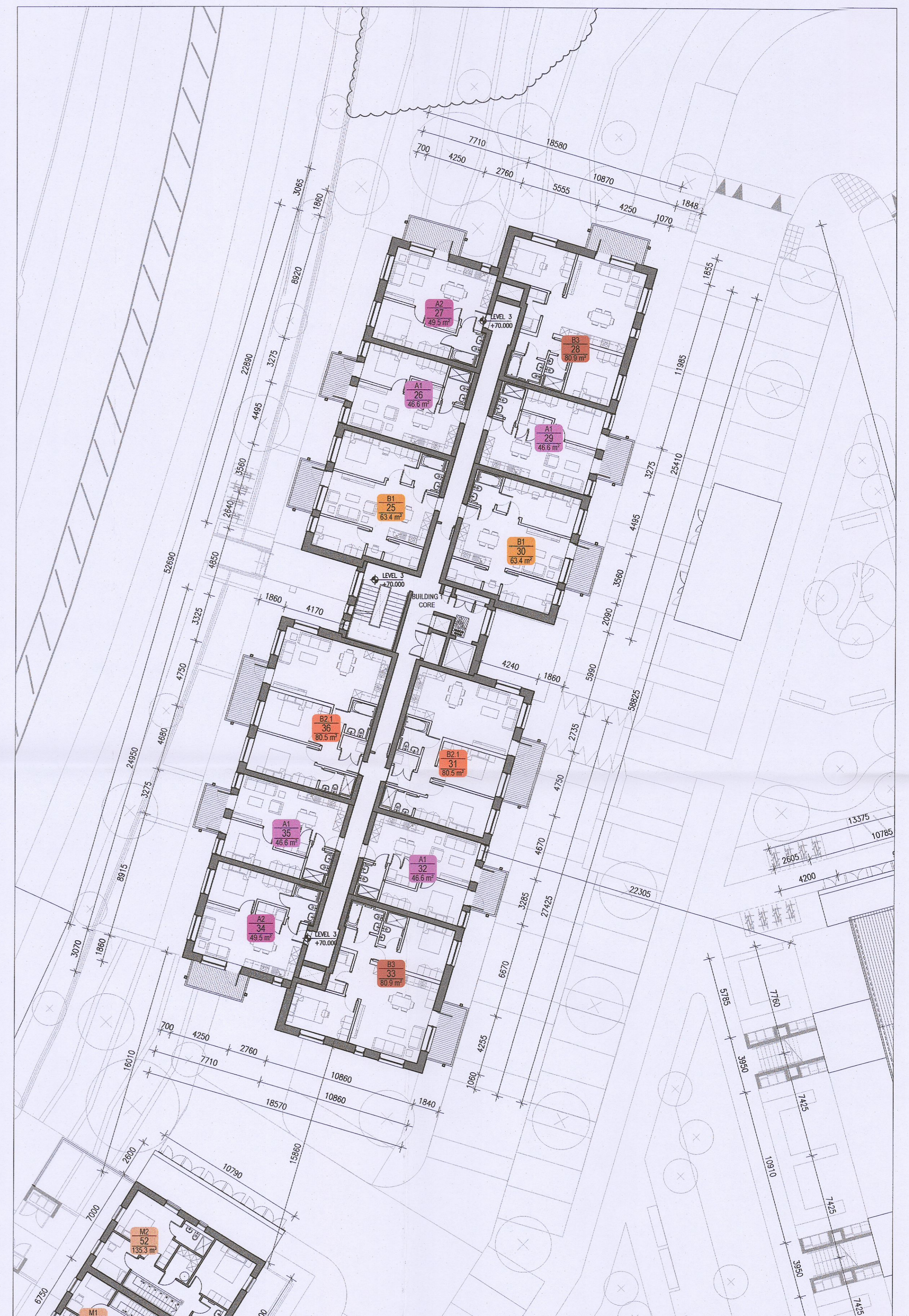
03 Block 01 Level 03 Floor Plan P-301 1:200

Notes: 1. Copyright Reserved 2. Work to figured dimensions only. Do not scale drawing. 3. The contractor is responsible for checking all levels and dimensions on site and shall refer all discrepancies to the Architect. 4. Where appropriate, for details of r.c. structure, or mechanical and electrical details, see Engineers drawings. 5. Proprietary items shall be fixed in strict accordance with manufacturers instructions. 6. Sizes of proprietary items shall be checked with manufacturer. 7. The contractor shall be responsible for the coordination of structure, finishes and services. B1_Proposed Plans.dwg 31/10/2023 16:05:26