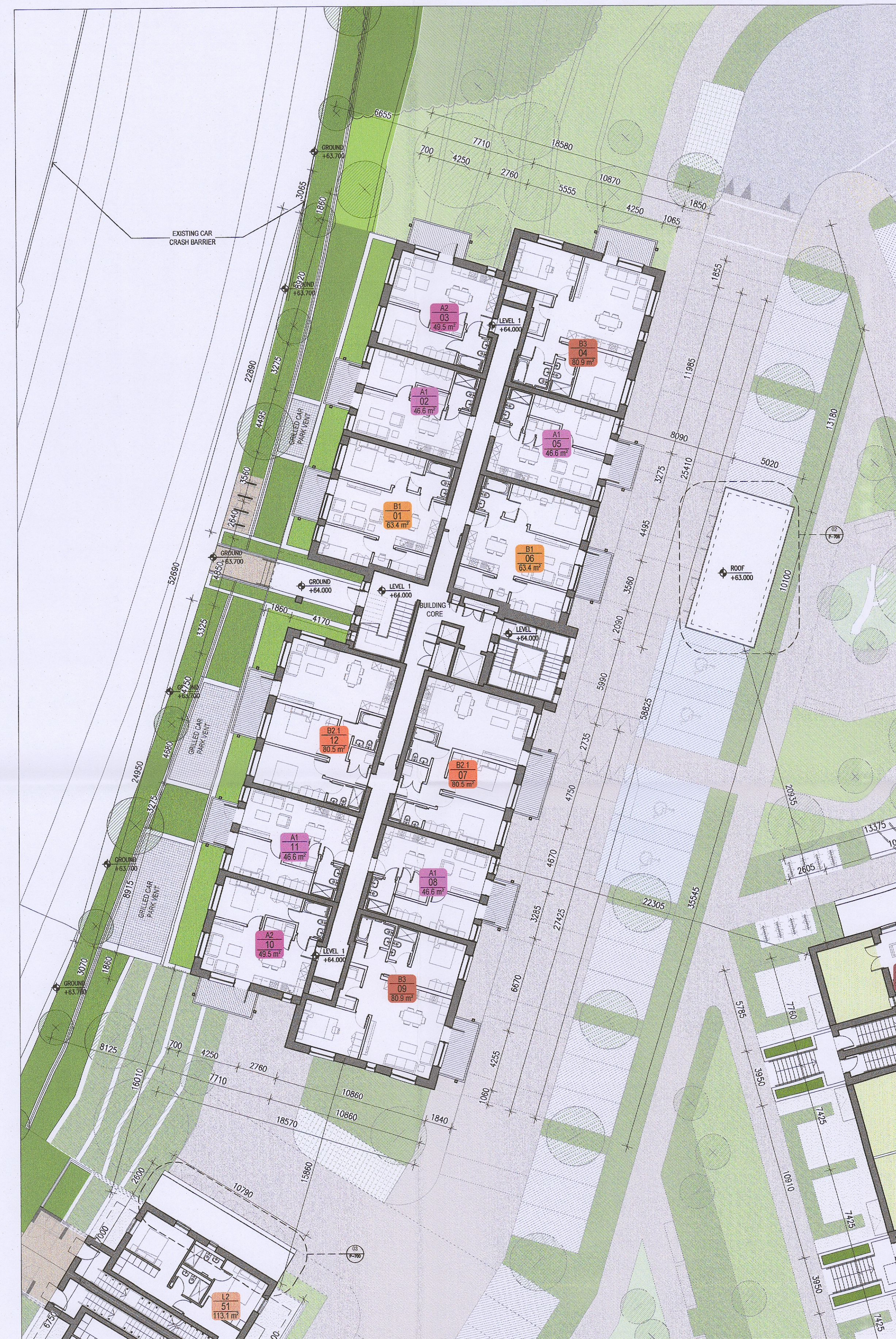
03 Block 01 Level 01 Floor Plan P-302 1:200