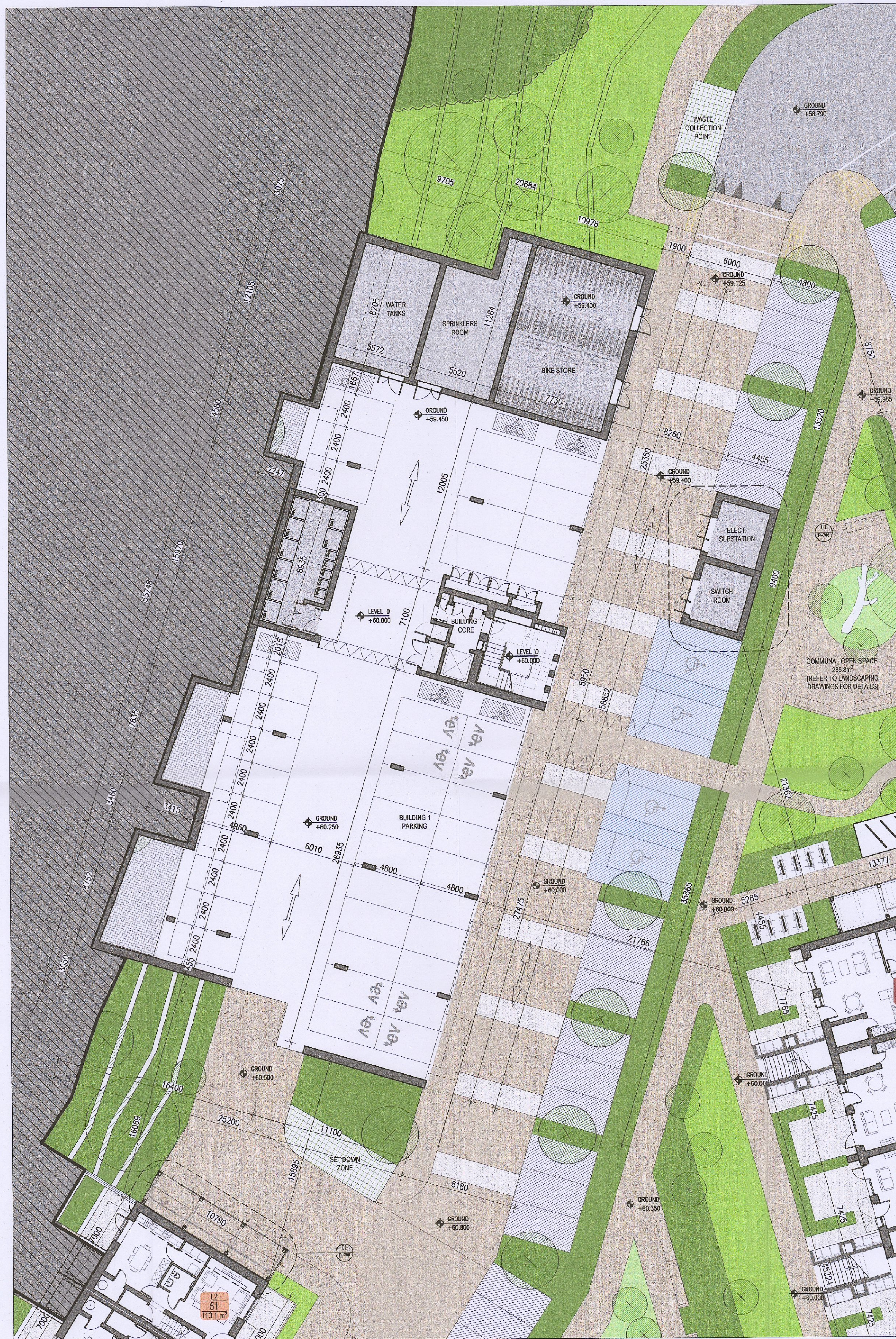
02 Block 01 Level 00 Floor Plan P-302 1:200