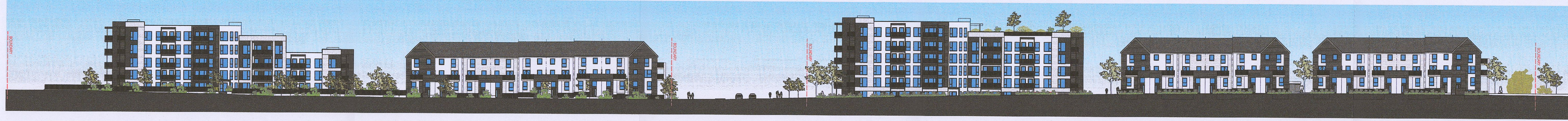
C-C P-051 1:500 @ A0 Proposed Street Elevation C-C R120 Newcastle Road Elevation looking East