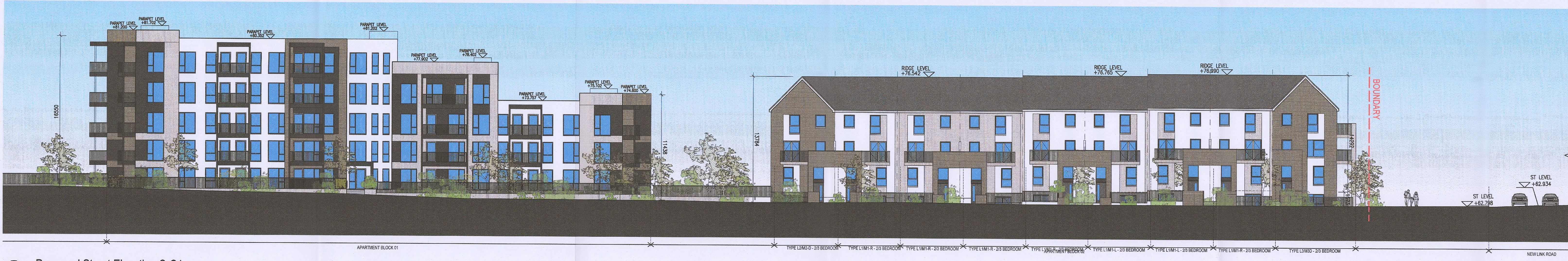
C-C1 P-051 1:200 @ A0 Proposed Street Elevation C-C1