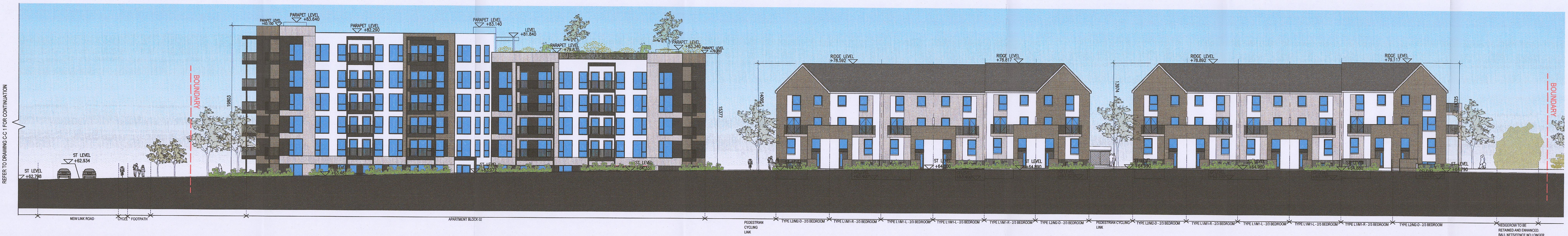
C-C2 P-051 1:200 @ A0 Proposed Street Elevation C-C2