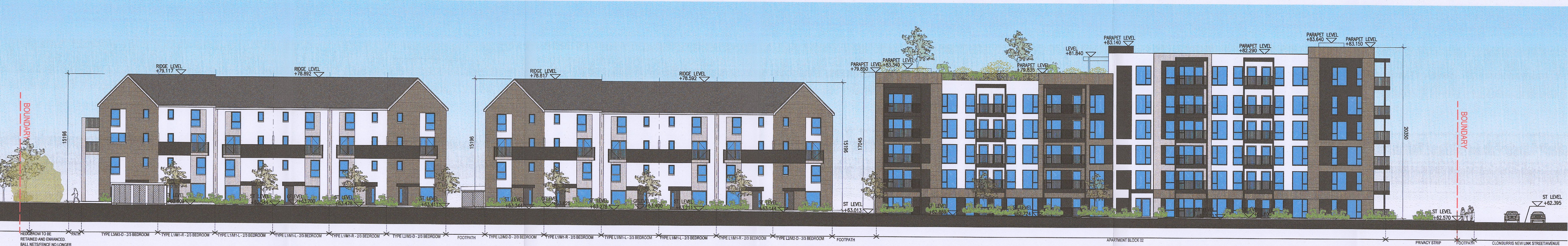
D-D P-051 1:200 @ A0 Proposed Street Elevation D-D