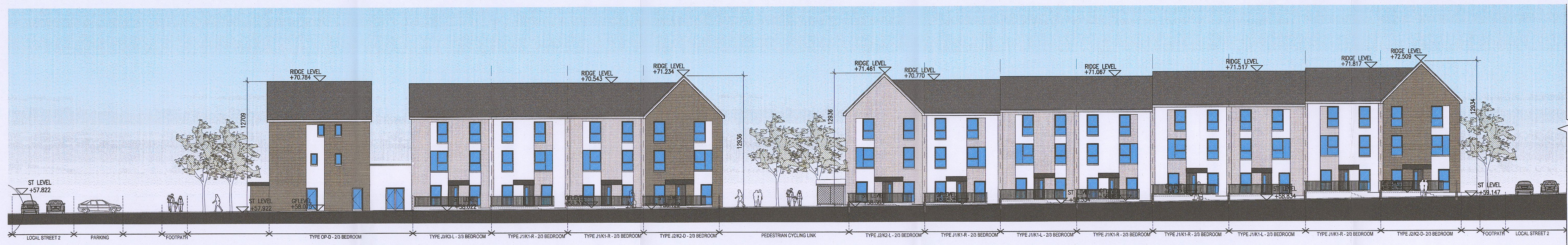
Proposed Street Elevation A-A 1 1:200 @ A0