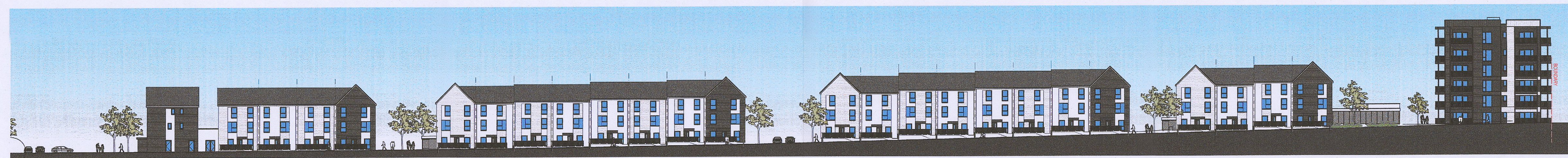
Proposed Street Elevation A-A 1:500 @ A0 Clonburris New Link Street / Avenue Elevation looking South