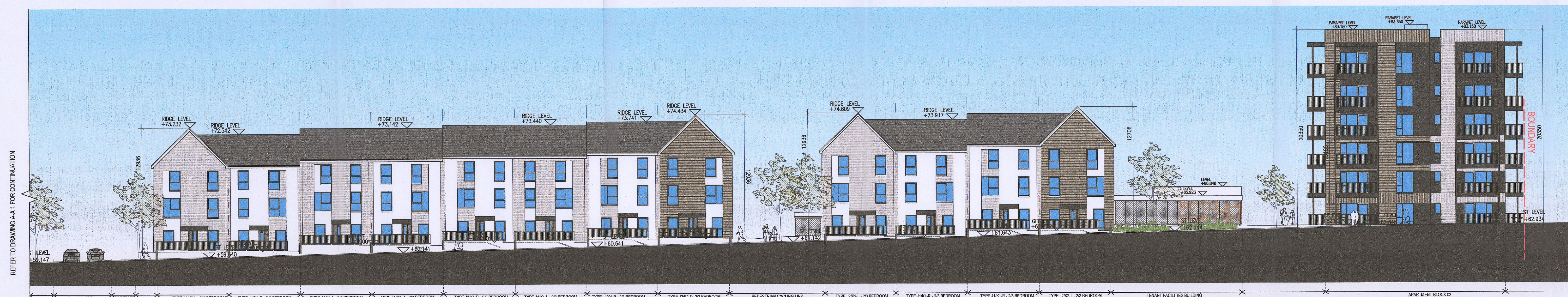
Proposed Street Elevation A-A 2 1:200 @ A0