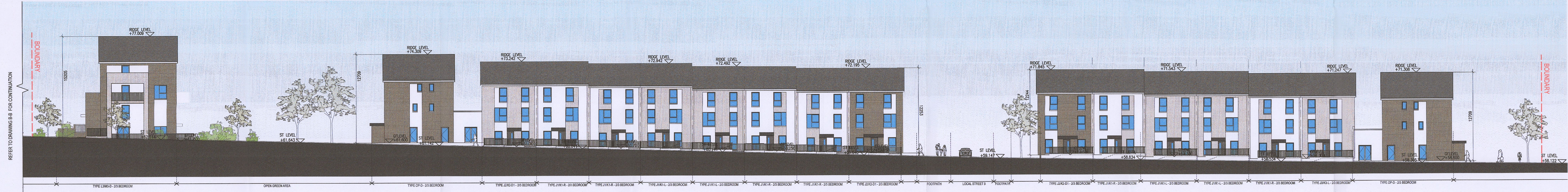
Proposed Street Elevation B-B 1:200 @ A0 Clonburris New Link Street / Avenue Elevation looking North