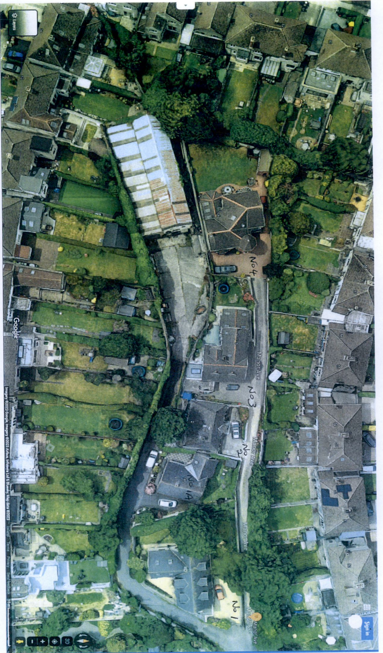
View of site from Google Maps showing location of 3 Manor Avenue in relation to existing Commercial Building