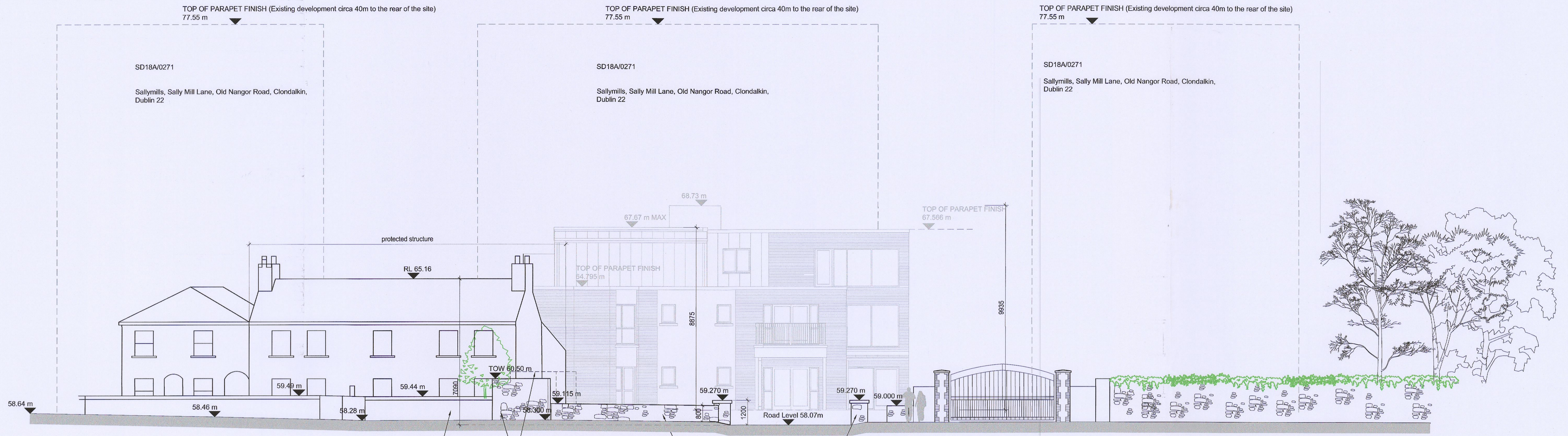
PROPOSED STREET ELEVATION (NORTH-EAST) Scale 1:100