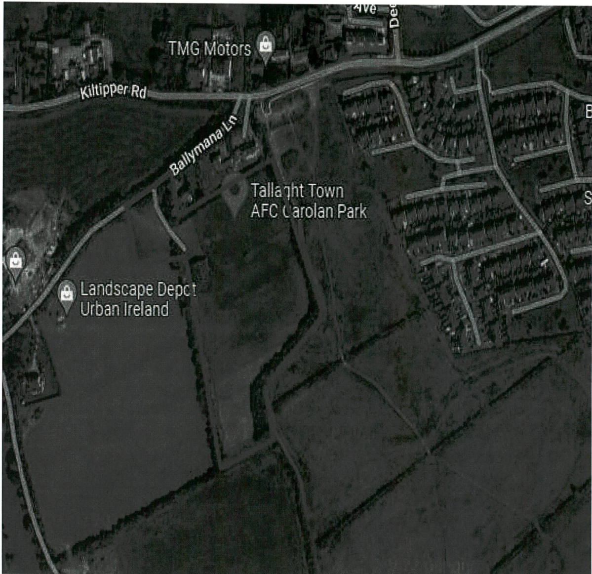
Figure 2: Existing Site

Smaller training pitches are located to the south of the main pitch and are separated from same by a barrier which surrounds the main pitch. A line of floodlights is located between the pitches with a second at the northern boundary.