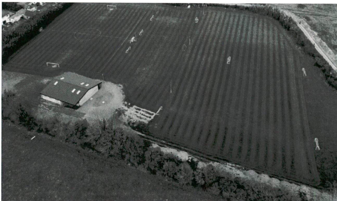
Figure 1: Carolan Park

The solution proposed in common with most outdoor games-based clubs is the development of Astro turf all-weather facilities.