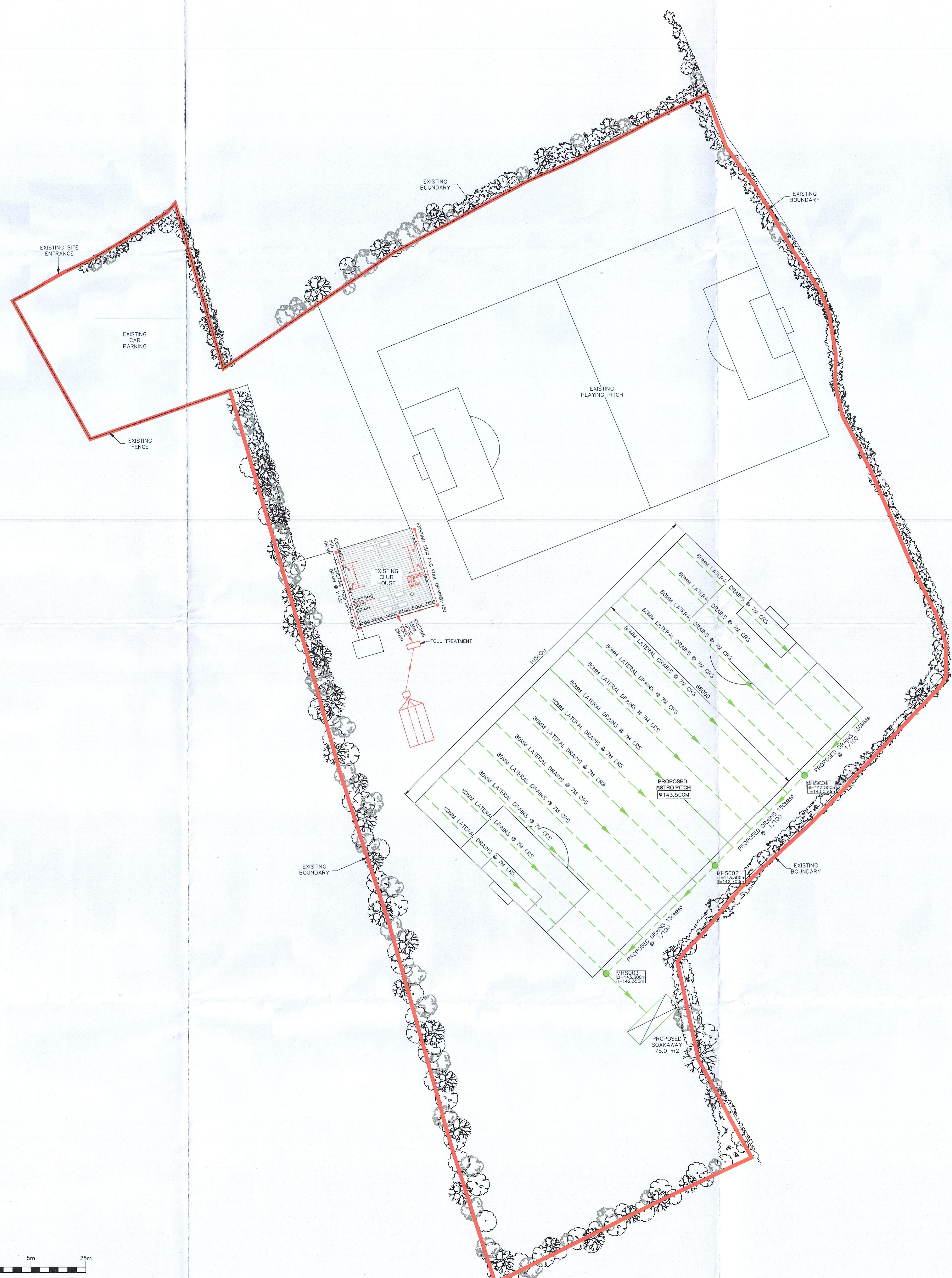
PROPOSED DRAINAGE LAYOUT SCALE 1:500