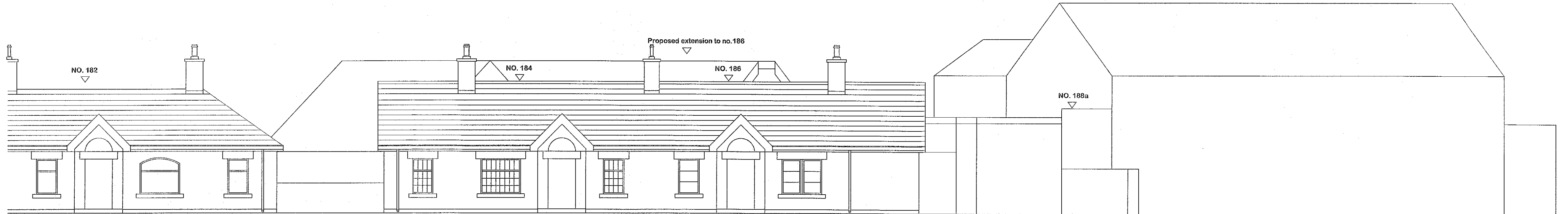
Proposed contiguous front elevation Scale 1/100