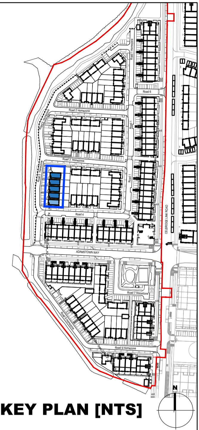
KEY PLAN [NTS]