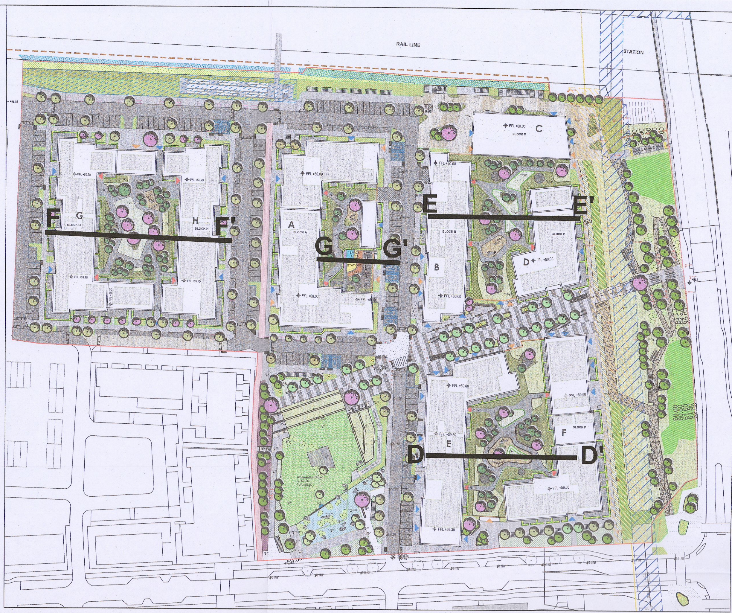
Key Plan_Scale 1:1000