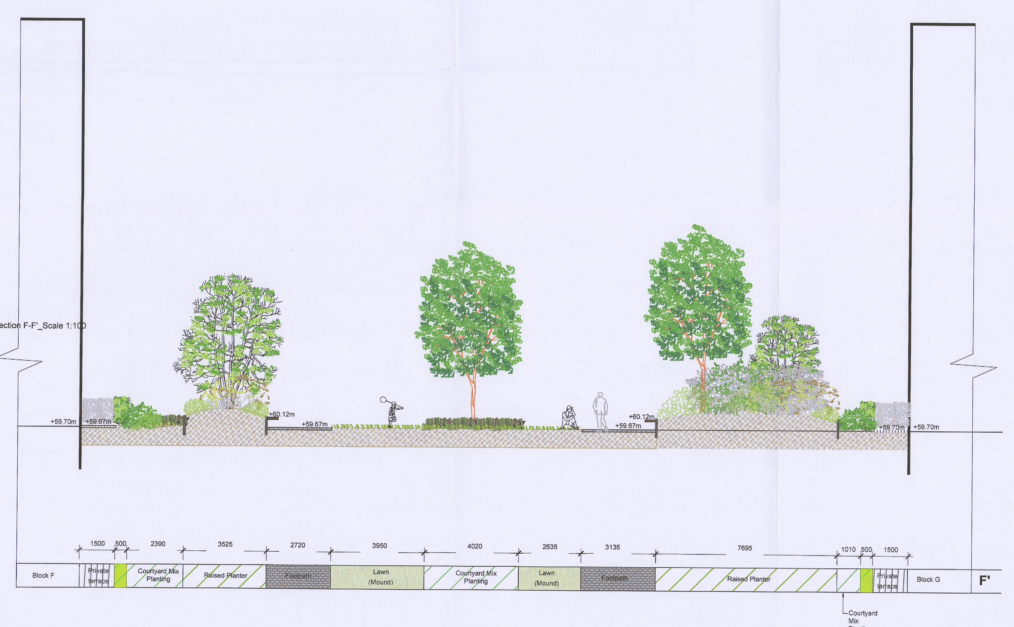
Section F-F'_Scale 1:100