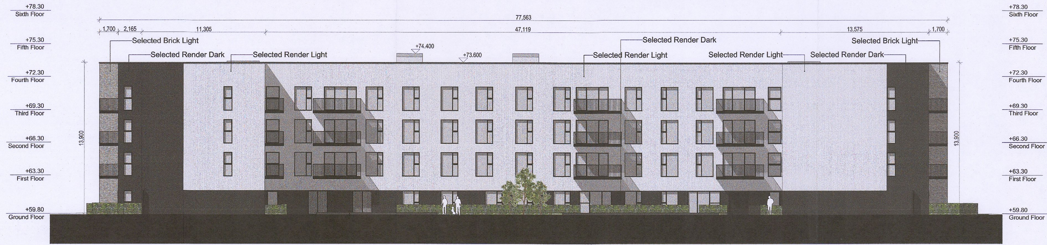
Elevation 04 SCALE:1:200