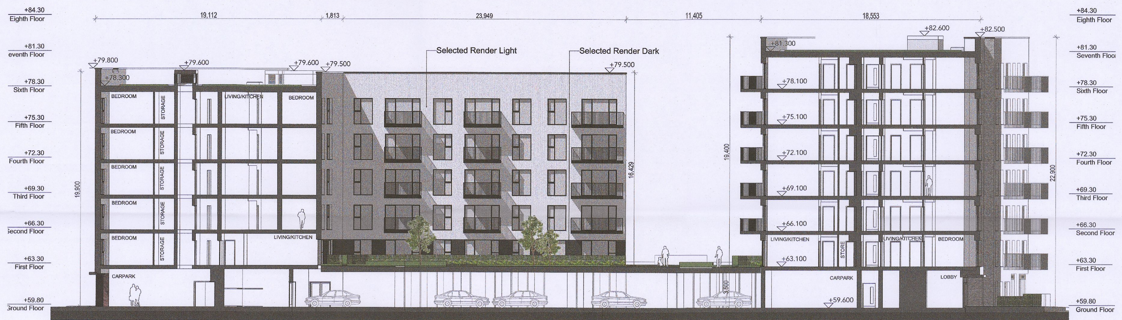
Elevation 03 SCALE:1:200