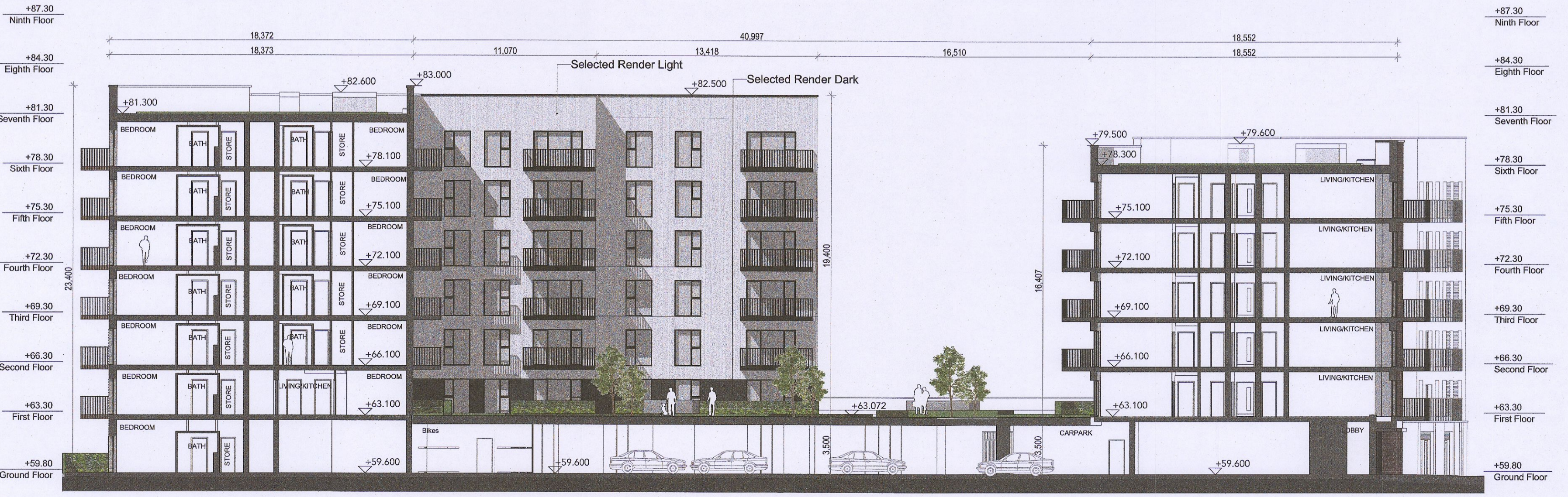
Elevation 04 SCALE:1:200