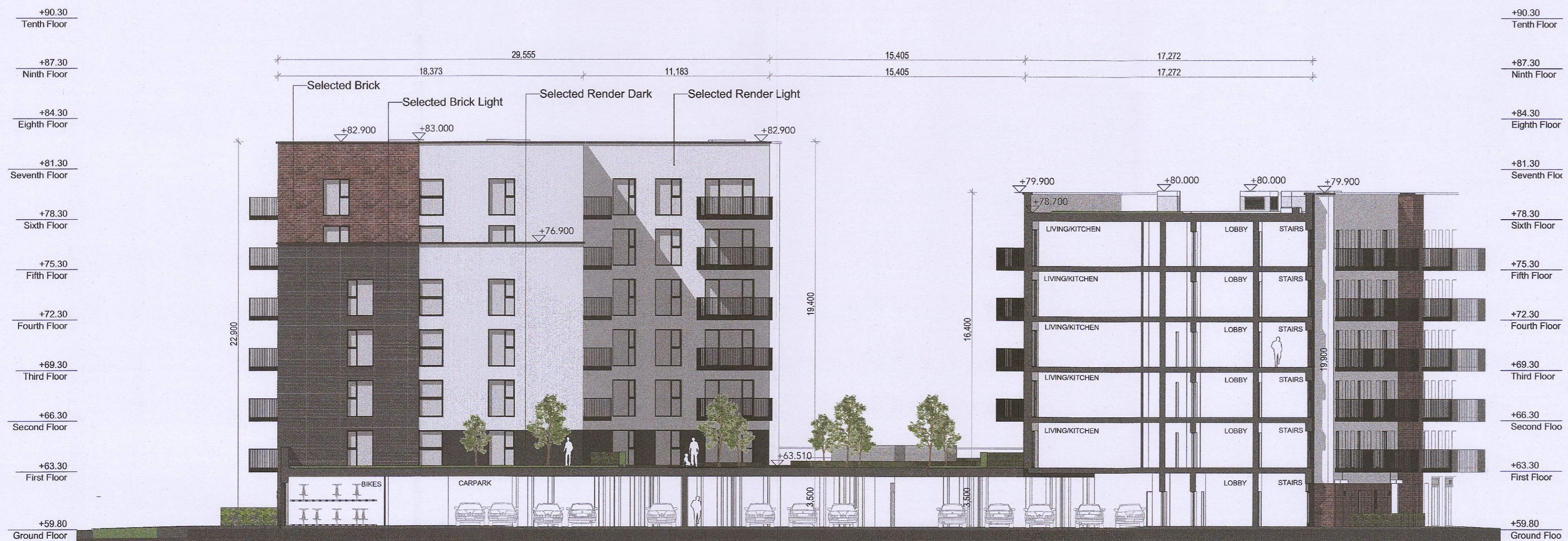
Elevation 03 SCALE:1:200