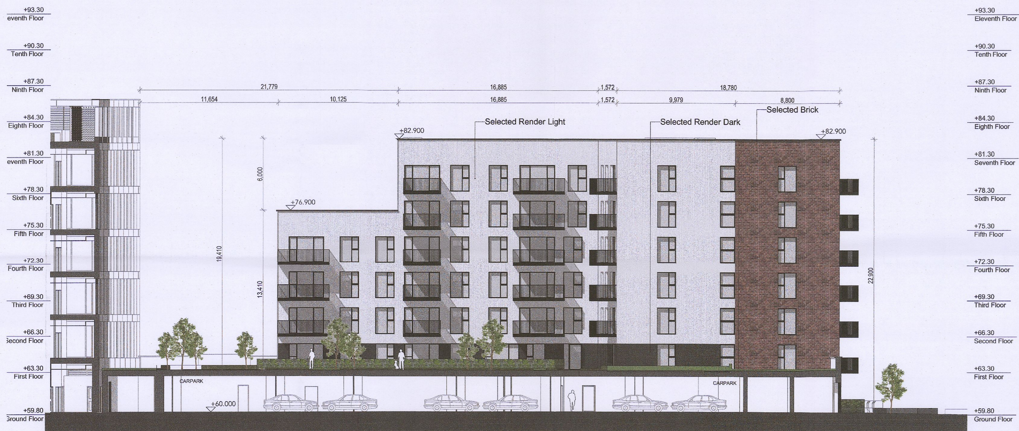
Elevation 02 SCALE:1:200