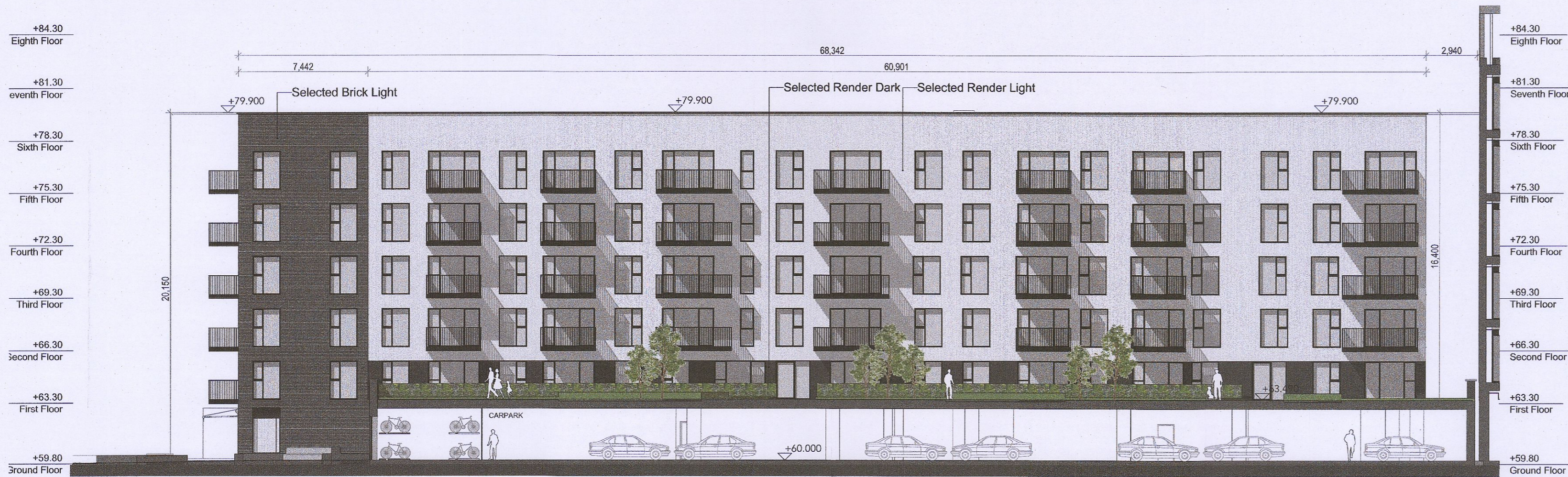
Elevation 01 SCALE:1:200