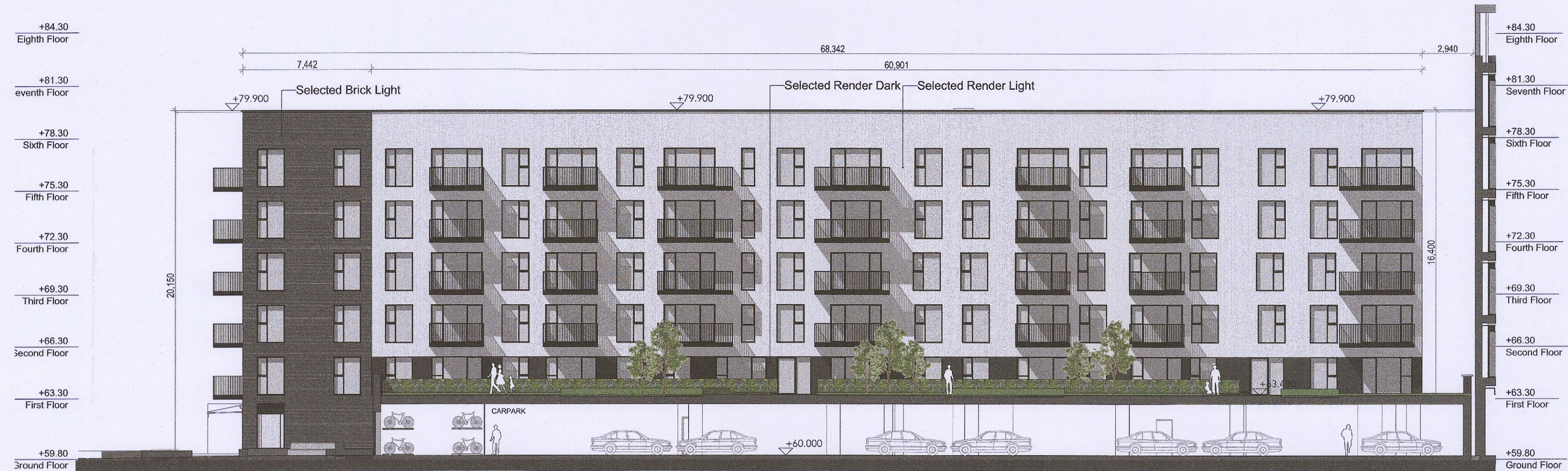
Elevation 01 SCALE:1:200